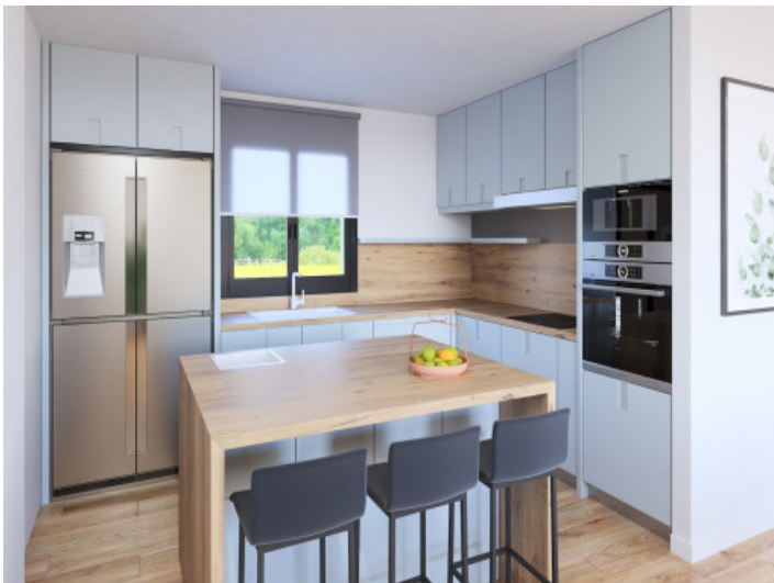
Modern kitchen with cooking island