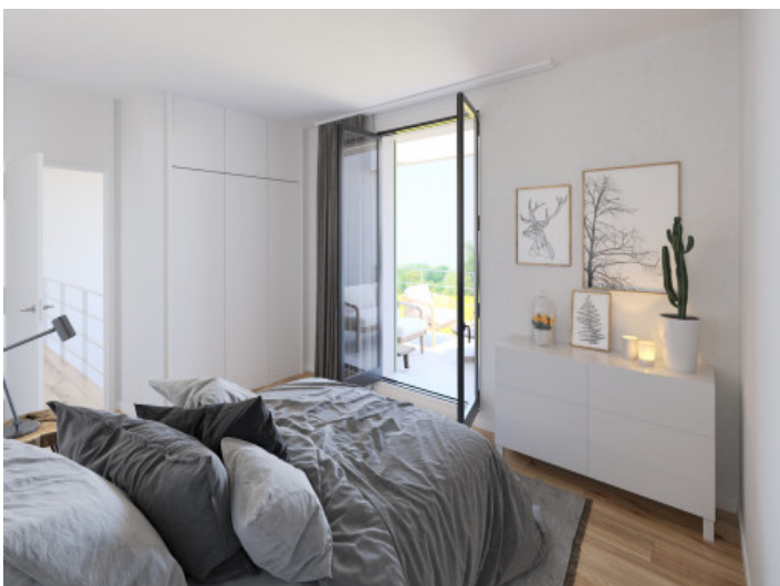
Bright double bedroom