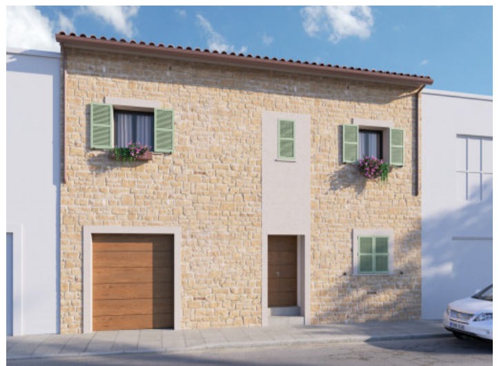
front view of the house

All information is correct to the best of our knowledge. Errors and prior sale excepted. This prospectus is purely for information purposes. Only the notarized deed of sale is legally binding.