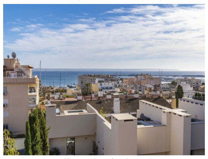
View over the roofs to the sea