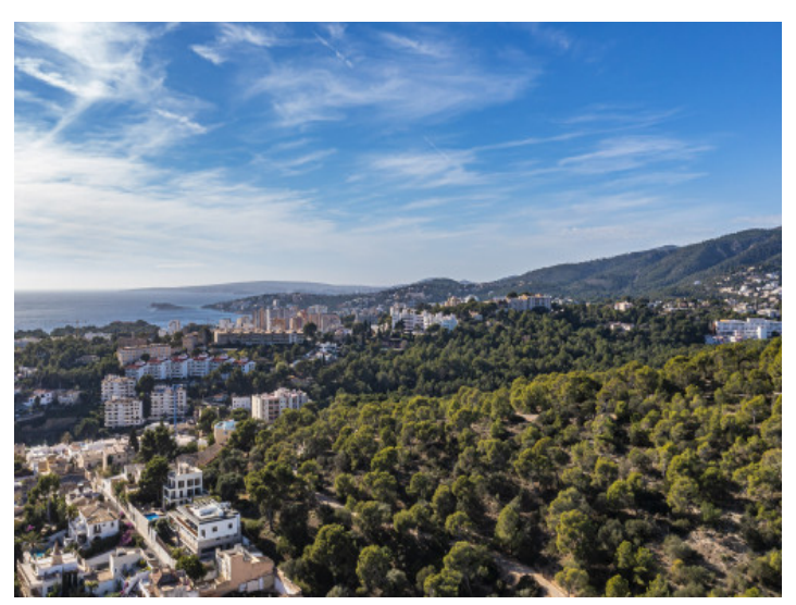
Bellver Forest is the city's green lung