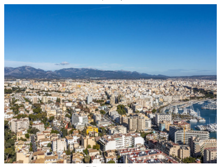
El Terreno district