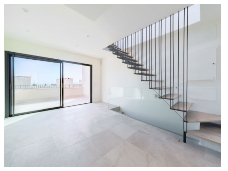
Open living area

All information is correct to the best of our knowledge. Errors and prior sale excepted. This prospectus is purely for information purposes. Only the notarized deed of sale is legally binding.