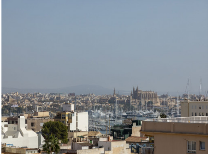
View to the cathedral from the roof top terrace

All information is correct to the best of our knowledge. Errors and prior sale excepted. This prospectus is purely for information purposes. Only the notarized deed of sale is legally binding.