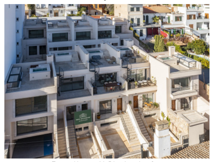
Terraced house with 3 levels and rooftop