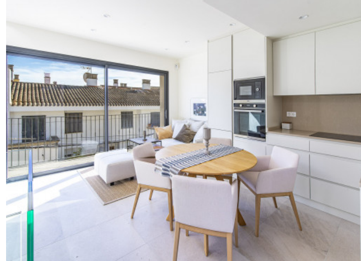
Modern american kitchen