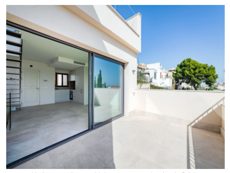
Modern town house with large terrace and a view in Palma