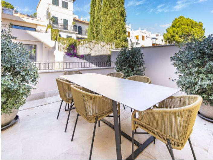
Large outdoor dining area