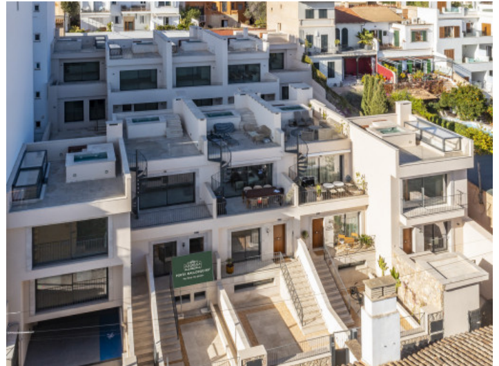
Terraced house with 3 levels