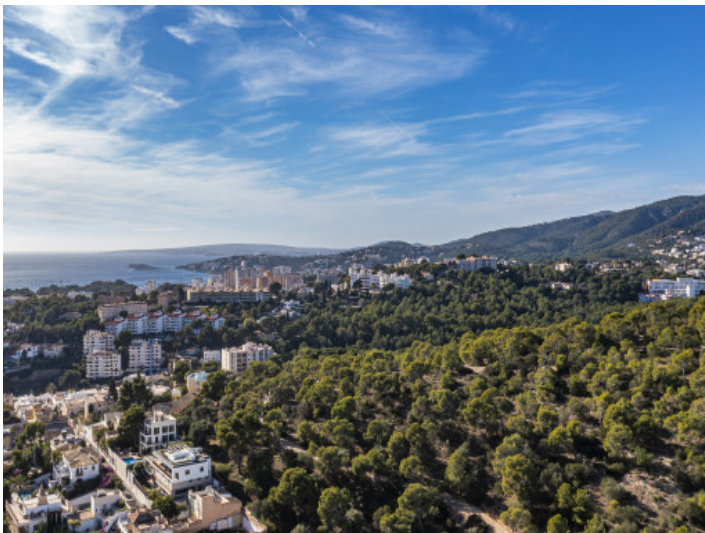
Bellver Forest is the city's green lung