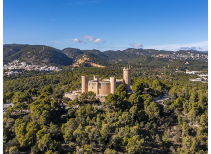
Castle of Bellver in walking distance