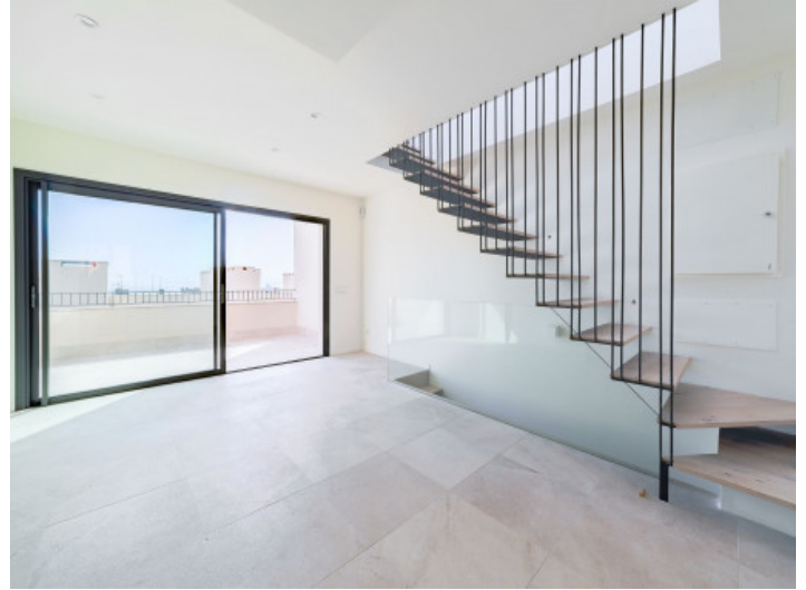
Open living area