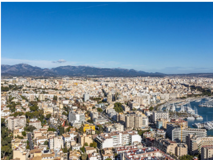
El Terreno district