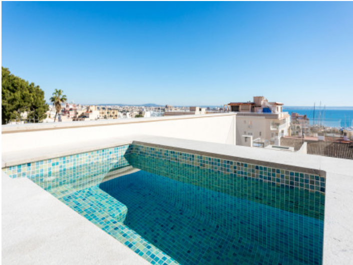
Rooftop with jacuzzi