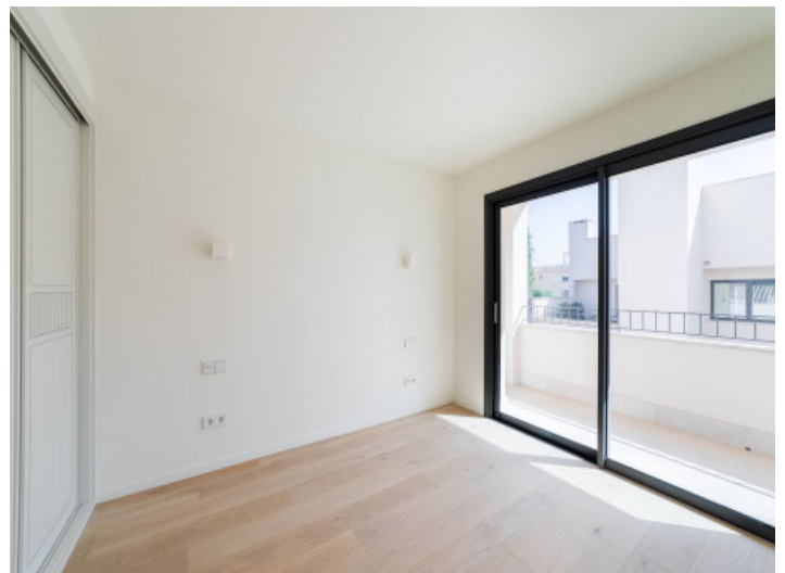
Bedroom with balcony

All information is correct to the best of our knowledge. Errors and prior sale excepted. This prospectus is purely for information purposes. Only the notarized deed of sale is legally binding.