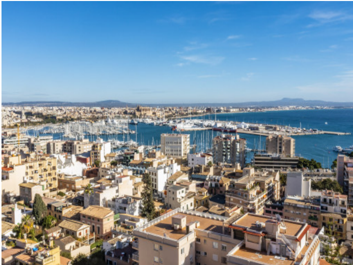
Close to the harbour and city center