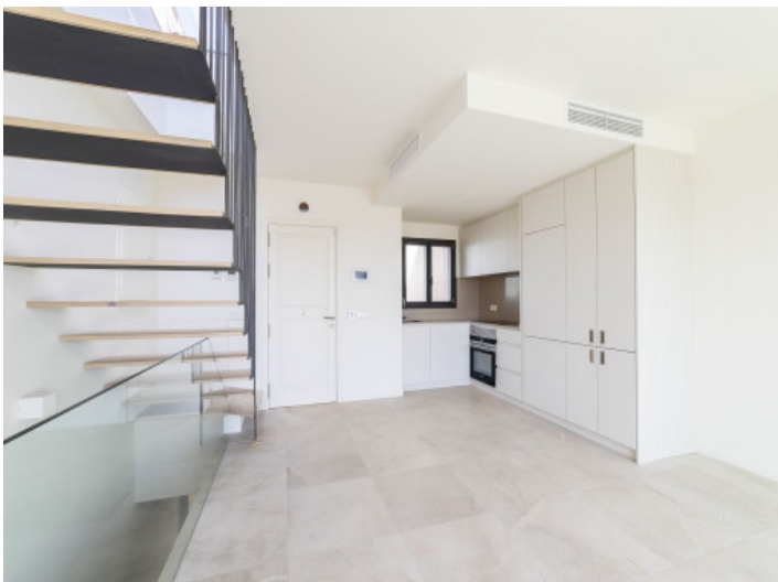
Open living area and kitchen