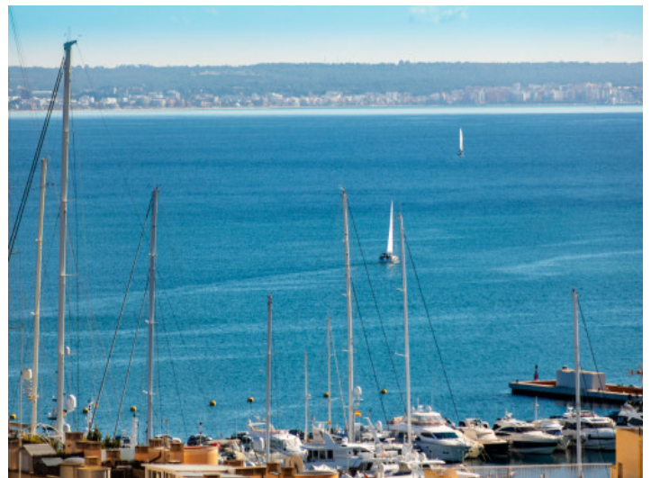
Town house with roof terrace with views to the cathedral of Palma

All information is correct to the best of our knowledge. Errors and prior sale excepted. This prospectus is purely for information purposes. Only the notarized deed of sale is legally binding.