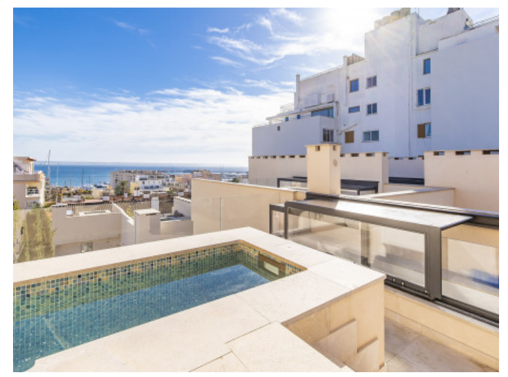
Rooftop with jacuzzi