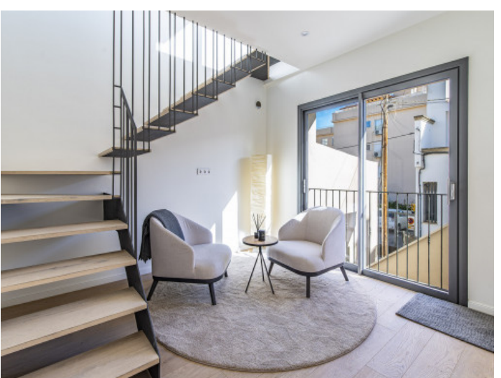
Bright entrance hall