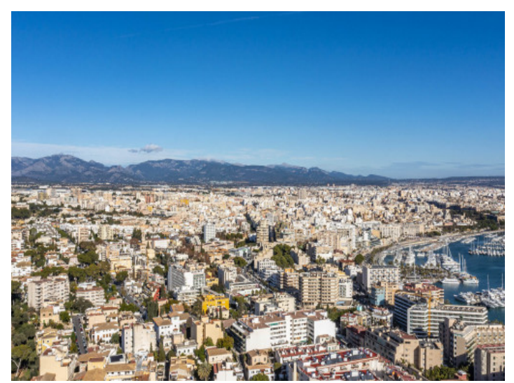
El Terreno district