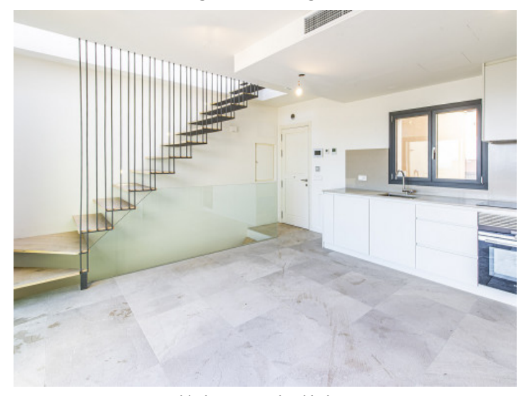
Modern open plan kitchen