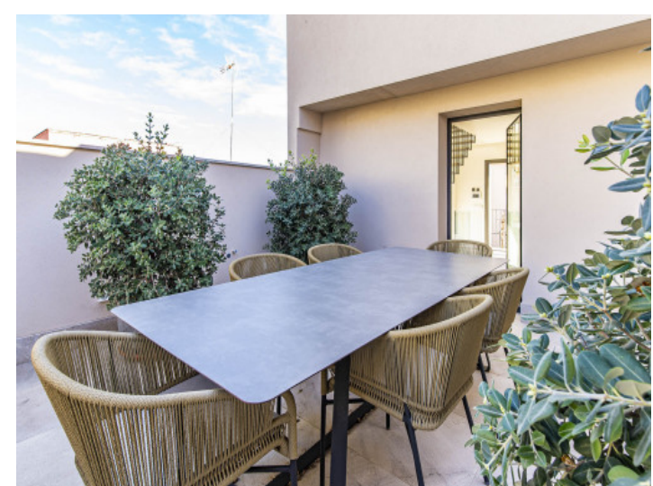
Great outdoor dining area