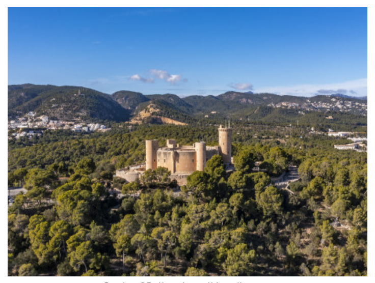
Castle of Bellver in walking distance