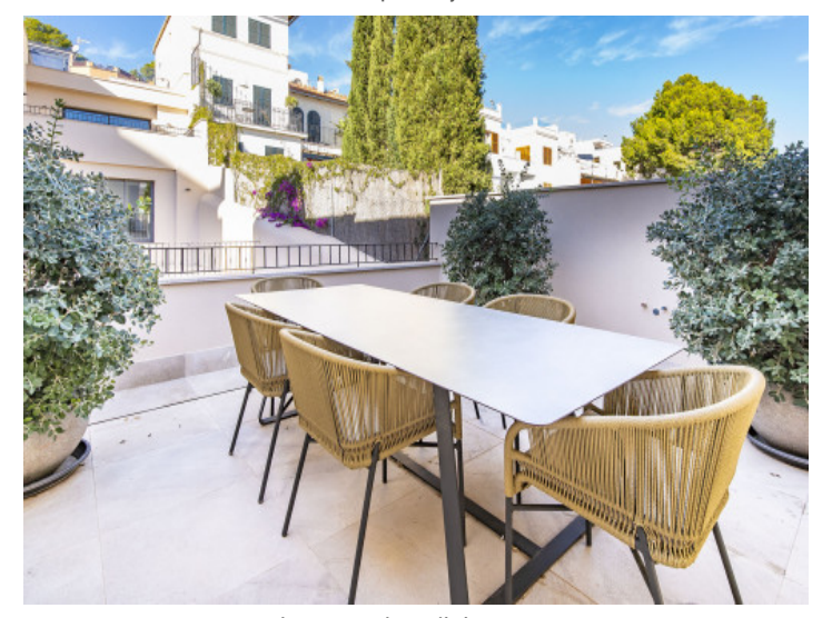
Large outdoor dining area