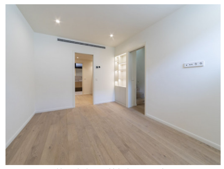
Master bedroom with bathroom en suite