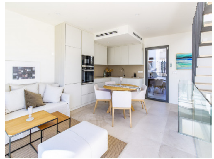
Open plan living and dining area