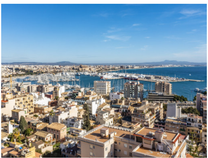
Close to the harbour and city center