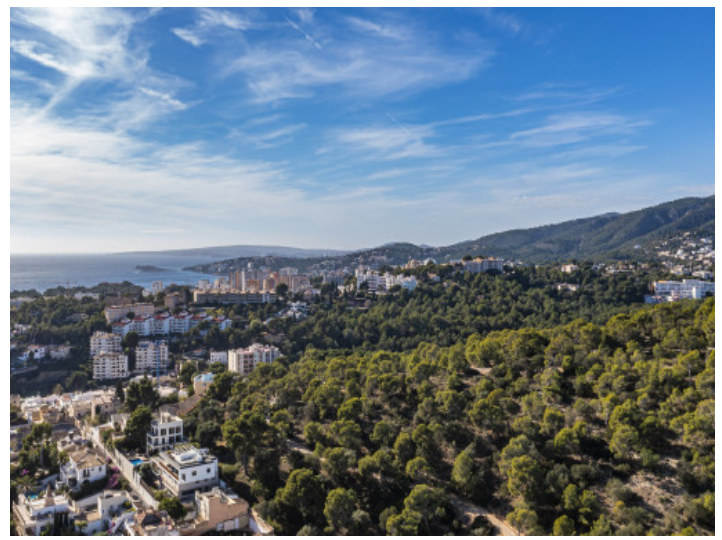
Bellver Forest is the city's green lung