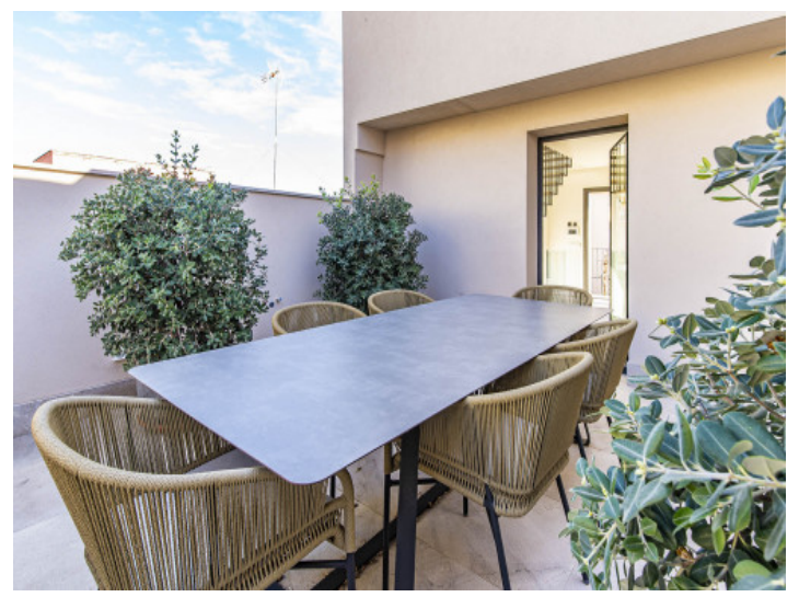
Great outdoor dining area