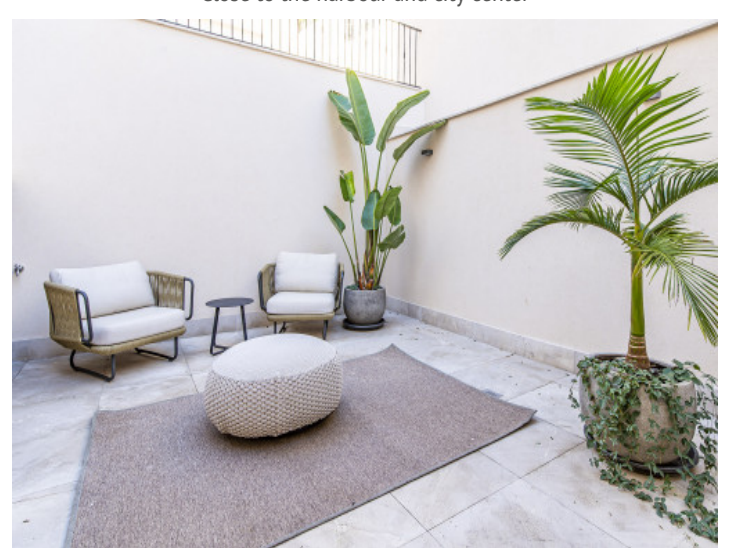
Private patio of the masterbedroom