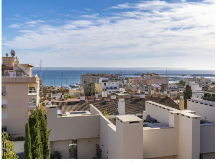
View over the roofs to the sea