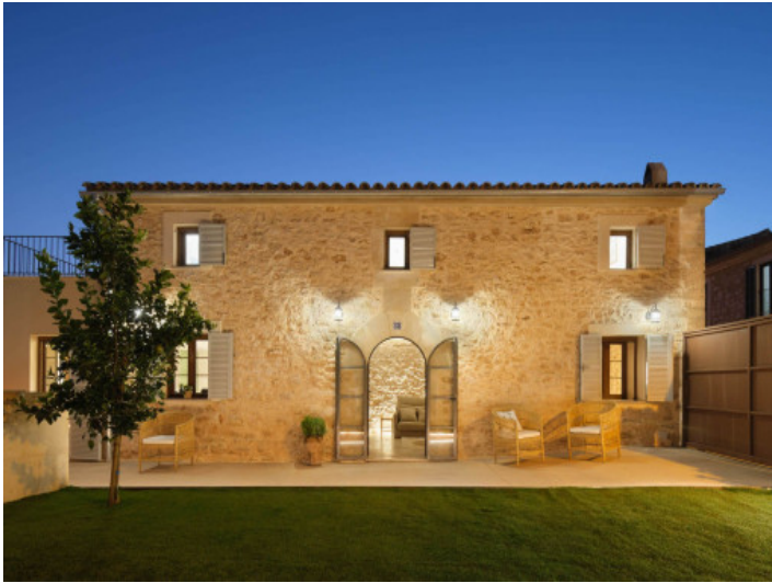
Exterior view by night