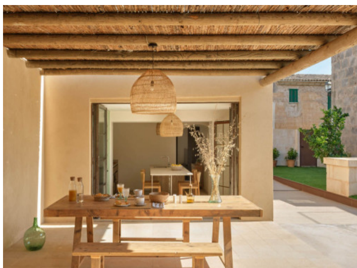
Lovely outdoor dining area