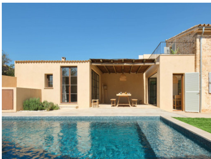
Pool and covered terrace