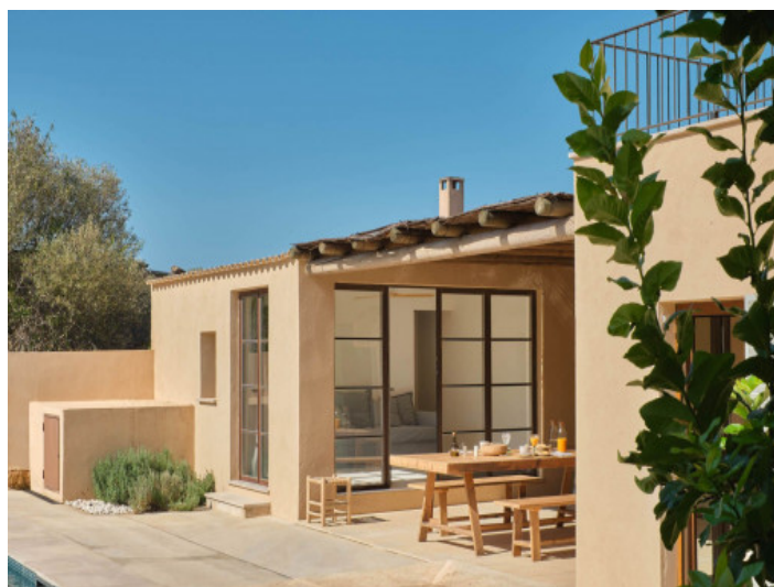
Terrace with access to the living area