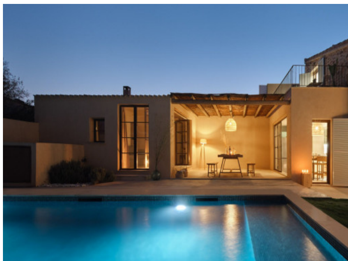
Pool by night