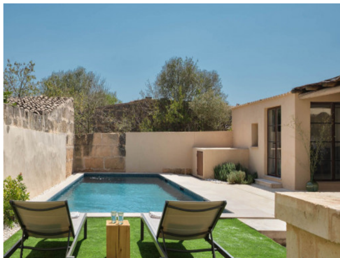
Private pool area