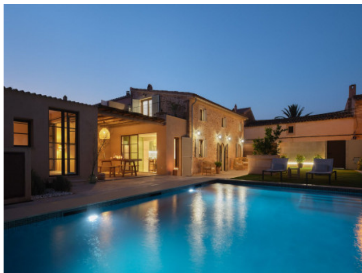
Pool by night

All information is correct to the best of our knowledge. Errors and prior sale excepted. This prospectus is purely for information purposes. Only the notarized deed of sale is legally binding.