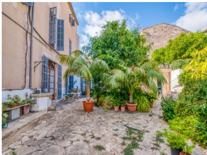
Patio and garden