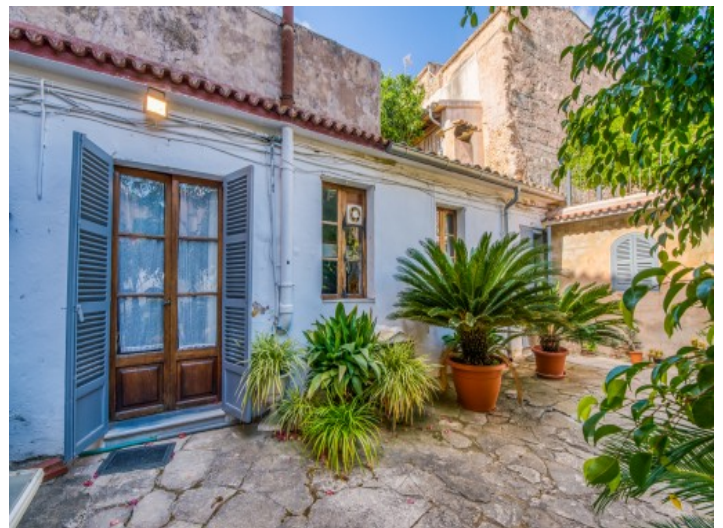
Patio and garden

All information is correct to the best of our knowledge. Errors and prior sale excepted. This prospectus is purely for information purposes. Only the notarized deed of sale is legally binding.