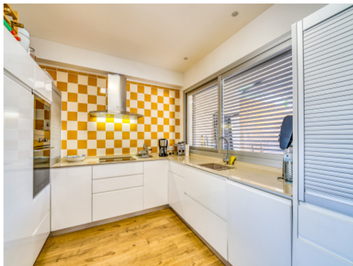
Modern fully equipped kitchen