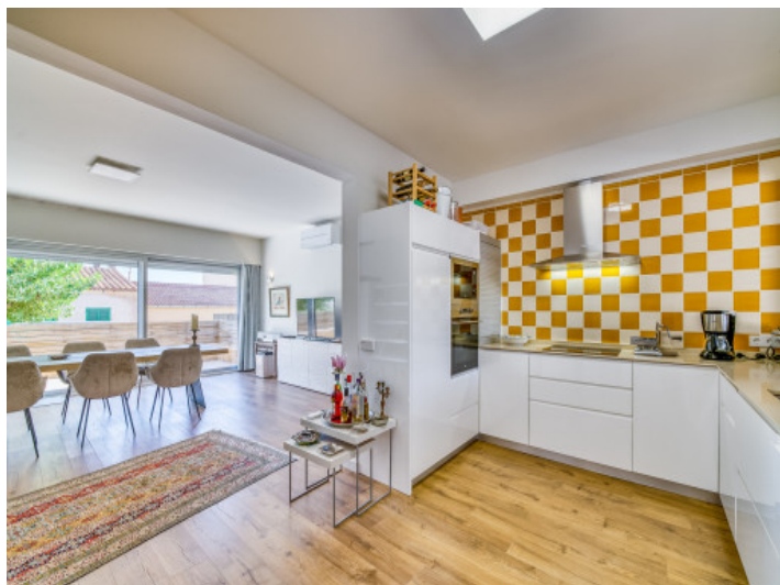
Ajoining open kitchen