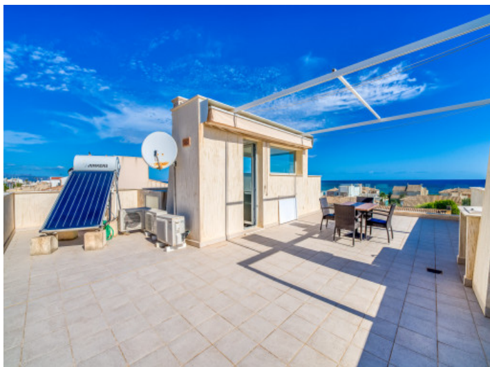
Terrace with ample space