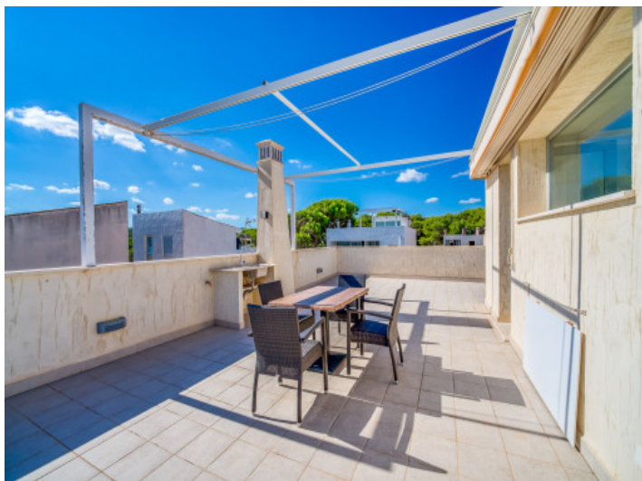
Outdoor dining area on the rooftop