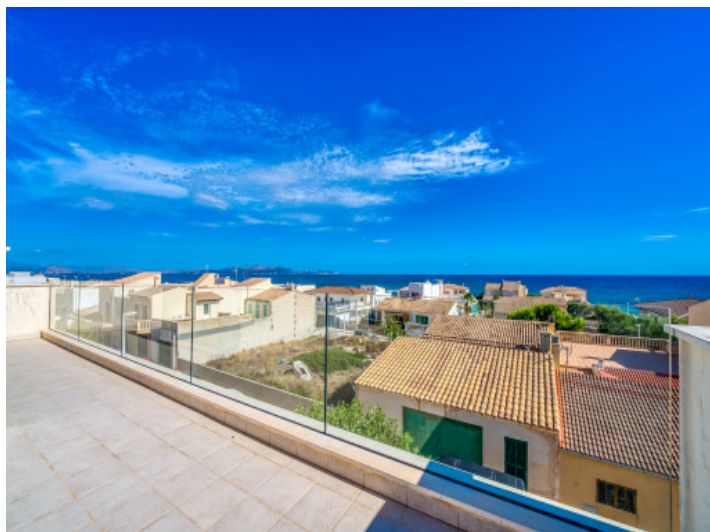
Fantastic panorama sea views