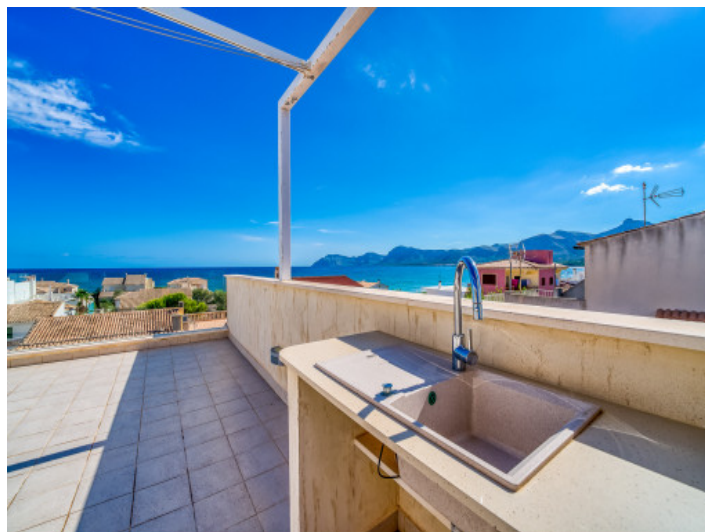
Rooftop kitchen with sea views