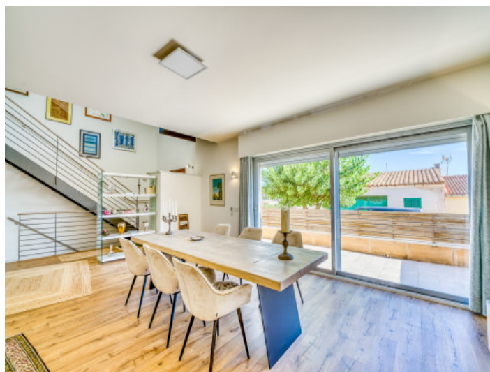
Elegant dining area on the lower level