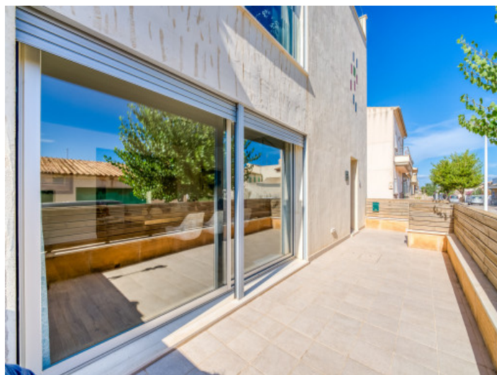
Spacious ground floor terrace

All information is correct to the best of our knowledge. Errors and prior sale excepted. This prospectus is purely for information purposes. Only the notarized deed of sale is legally binding.