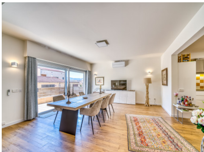
Open dining area with terrace access