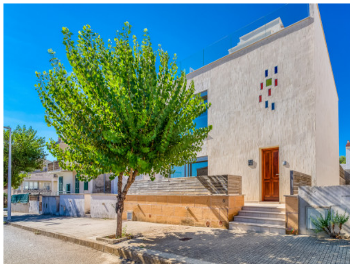
View of the villa from the street

All information is correct to the best of our knowledge. Errors and prior sale excepted. This prospectus is purely for information purposes. Only the notarized deed of sale is legally binding.