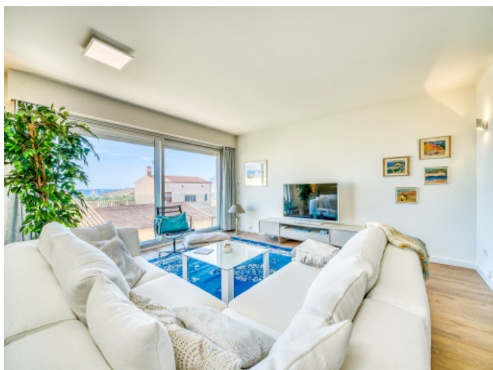
Lightflooded living area with sea views