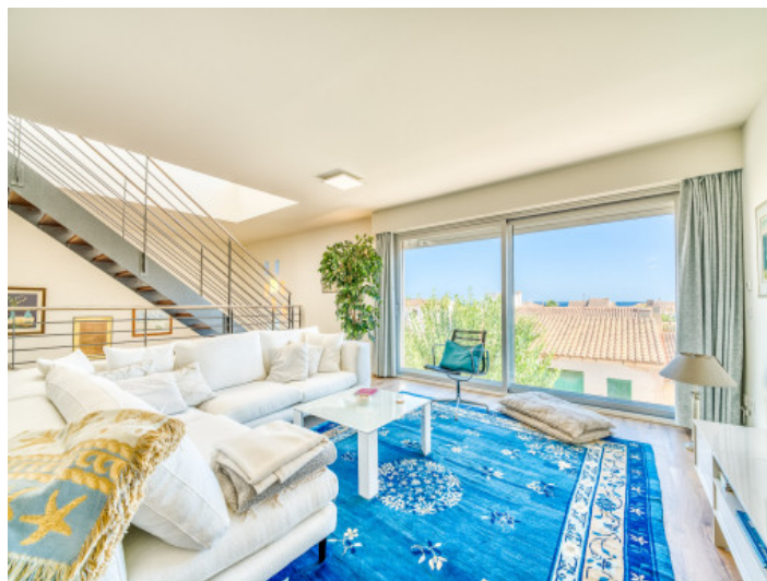
Elegant living area on the upper floor