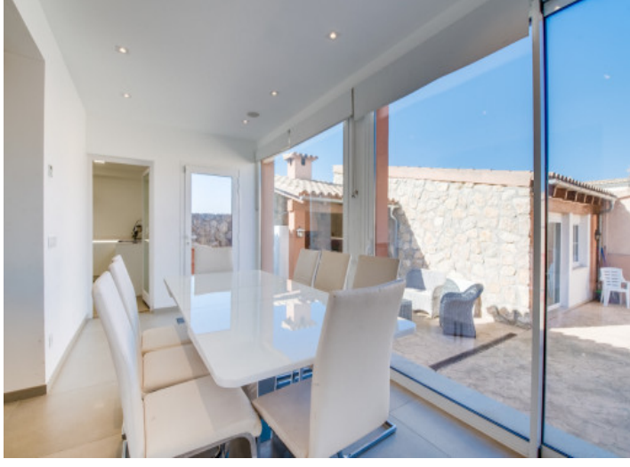
Lightflooded dining area with terrace access