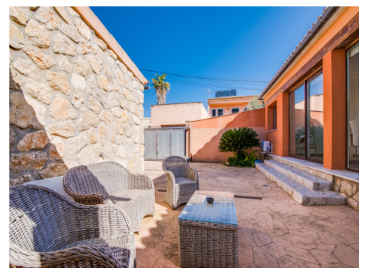
Spacious patio with seating area

PORTA MALLORQUINA® Your home. Our passion.