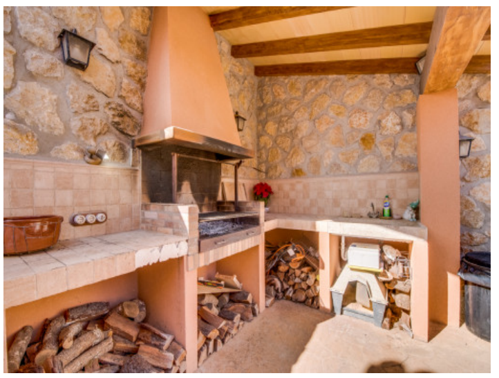
Rustic bbq area