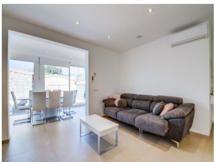
Adjoining, comfortable living area