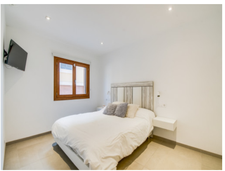
One of 5 bedrooms One of 5 bedrooms. All information is correct to the best of our knowledge. Errors and prior sale excepted. This prospectus is purely for information purposes. Only the notarized deed of sale is legally binding.

PORTA MALLORQUINA • C./ CONQUISTADOR 8, 07001 PALMA TEL. +34 971 698 242 • INFO@PORTAMALLORQUINA.COM