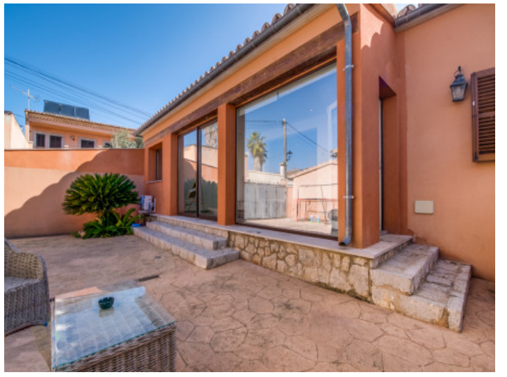
Patio and access to the dining area