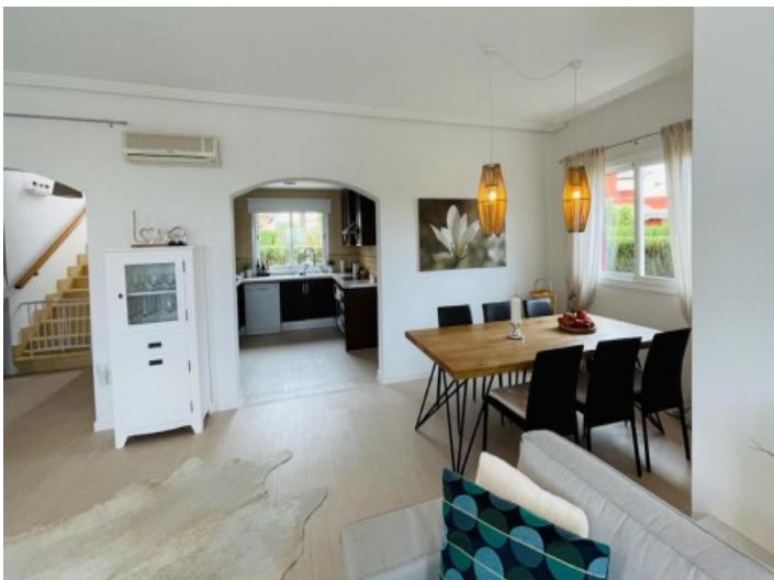
Access to the kitchen