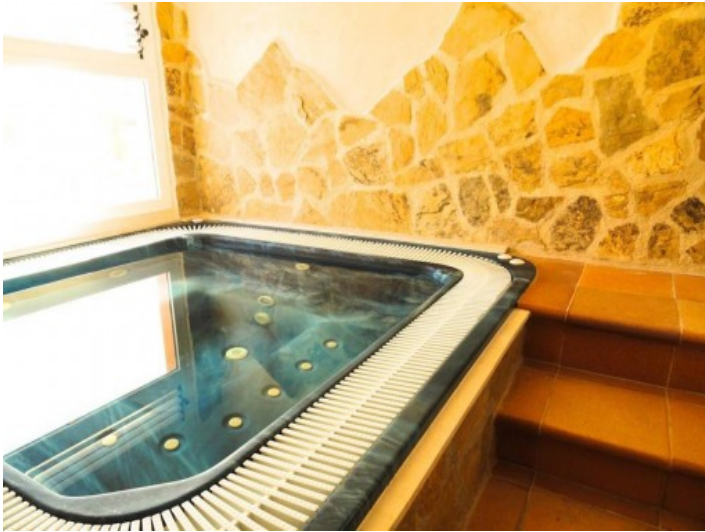
Spa area with jacuzzi