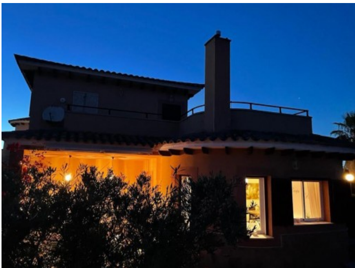
The villa by night