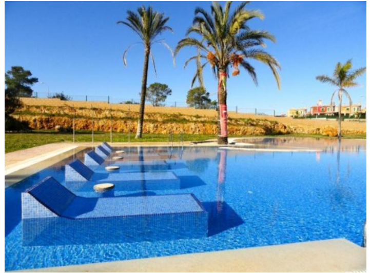
Sun loungers in the pool