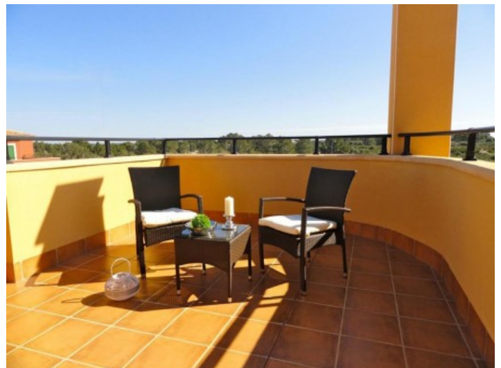
Balcony with sitting area

All information is correct to the best of our knowledge. Errors and prior sale excepted. This prospectus is purely for information purposes. Only the notarized deed of sale is legally binding.