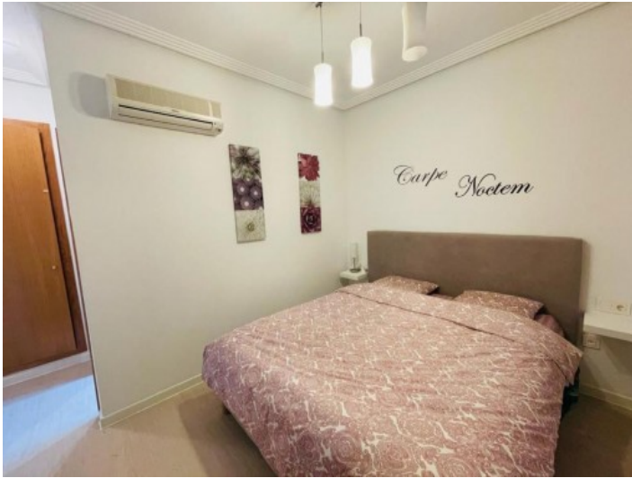
View of the double bedroom