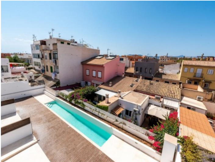
View to the pool area