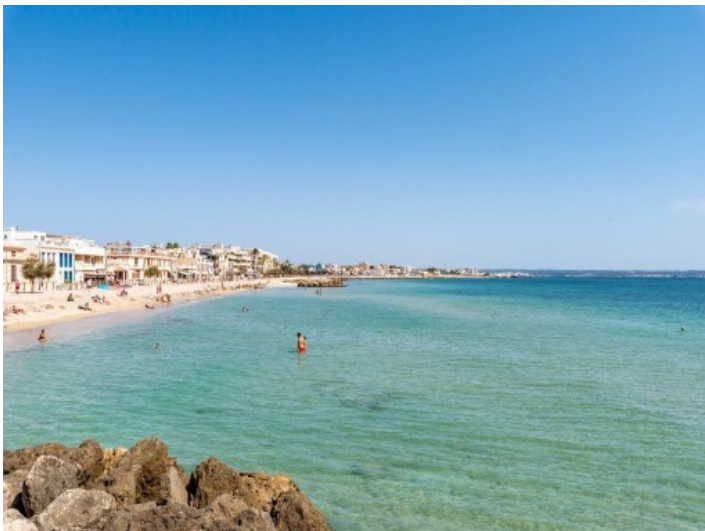
View of the sea in Molinar

All information is correct to the best of our knowledge. Errors and prior sale excepted. This prospectus is purely for information purposes. Only the notarized deed of sale is legally binding.