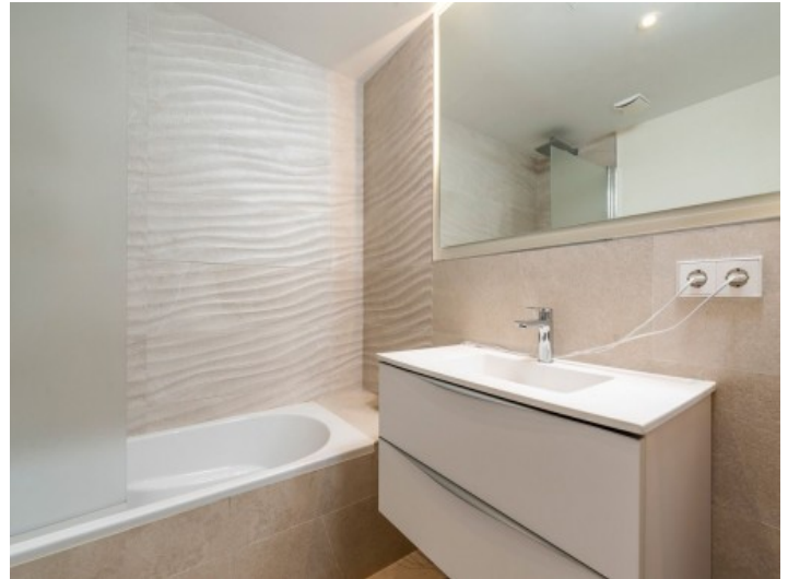
Bathroom with bath tub