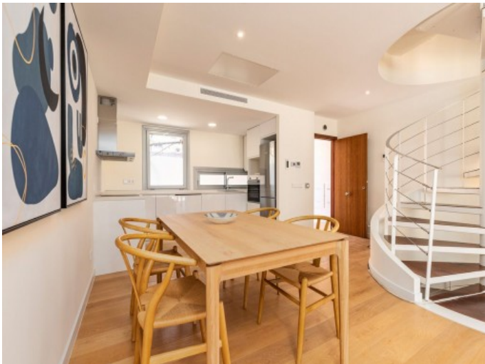
View to the kitchen