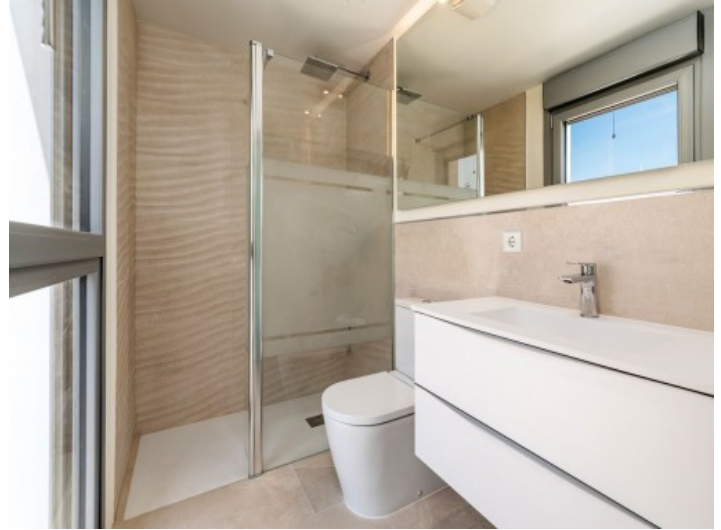
Bathroom en suite with shower