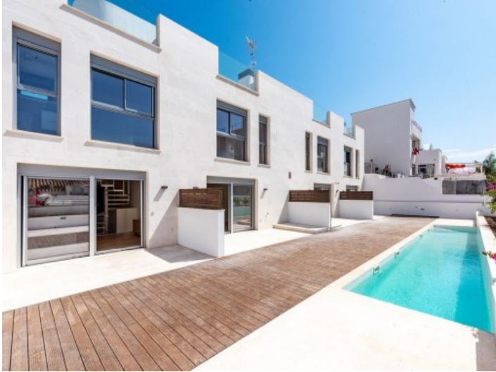
View of the shared pool area