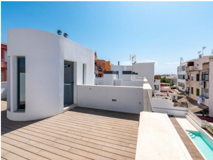
Sunny roof terrace