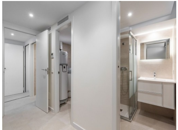
Utility room with bathroom

All information is correct to the best of our knowledge. Errors and prior sale excepted. This prospectus is purely for information purposes. Only the notarized deed of sale is legally binding.