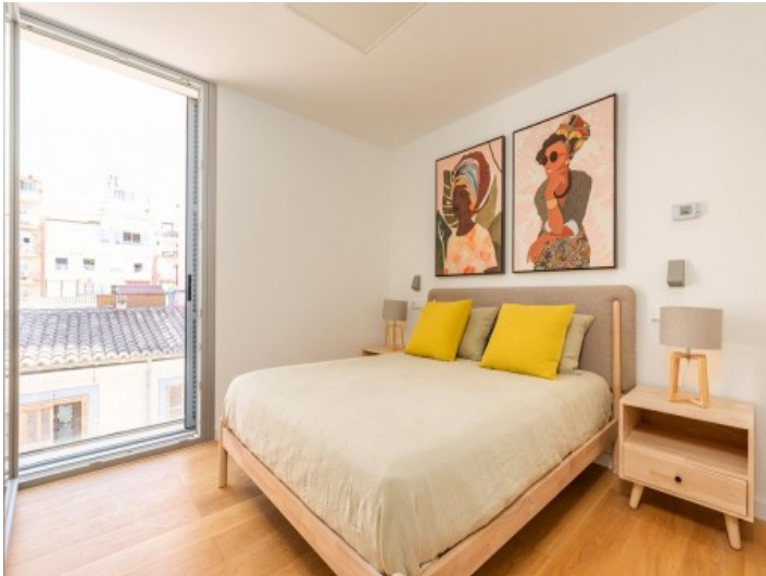
Second double bedroom