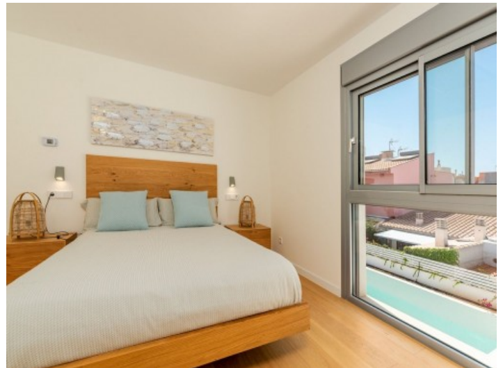
Master bedroom with pool view

All information is correct to the best of our knowledge. Errors and prior sale excepted. This prospectus is purely for information purposes. Only the notarized deed of sale is legally binding.