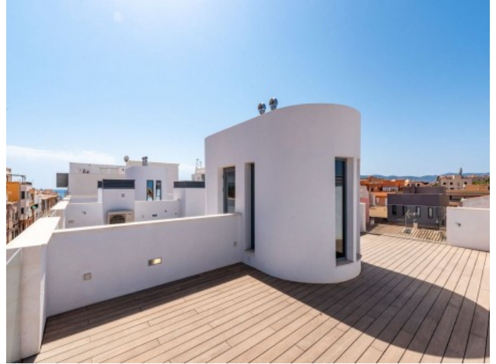
Spacious roof terrace