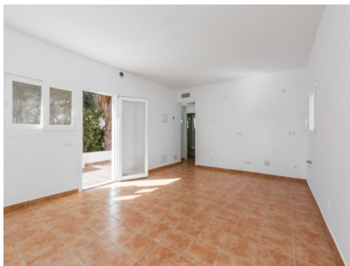
Alternative view of the bungalow