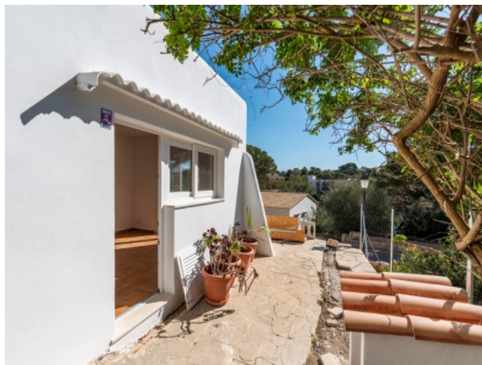
Access to the second bungalow