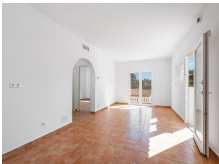
Loghtflooded living area