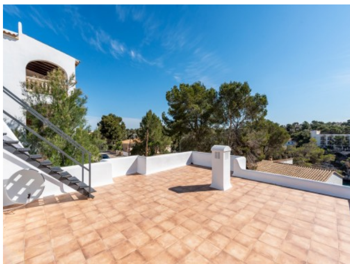
Sunny roof terrace