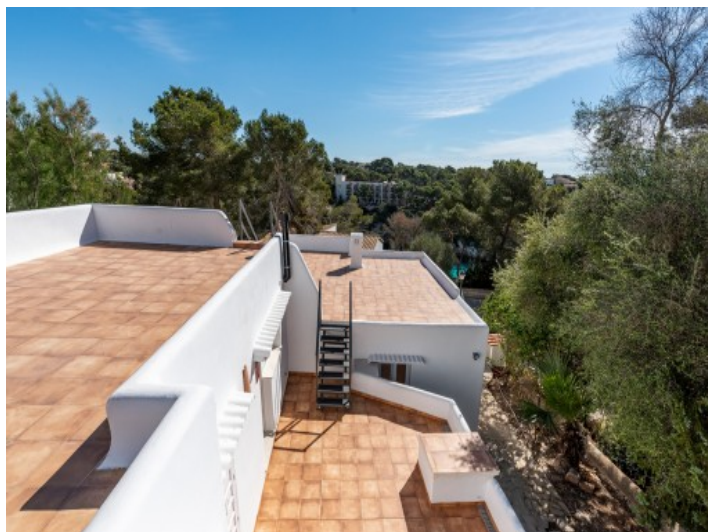
Various roof terrace