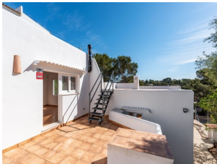
Terrace with upper bungalow