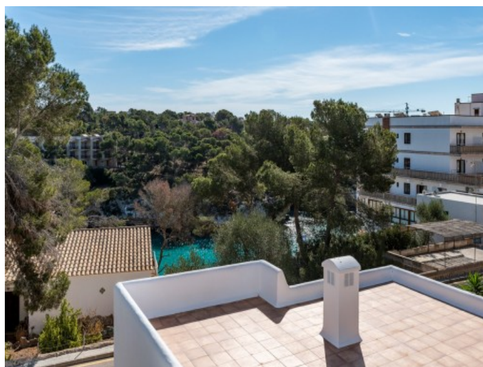
View to the bay