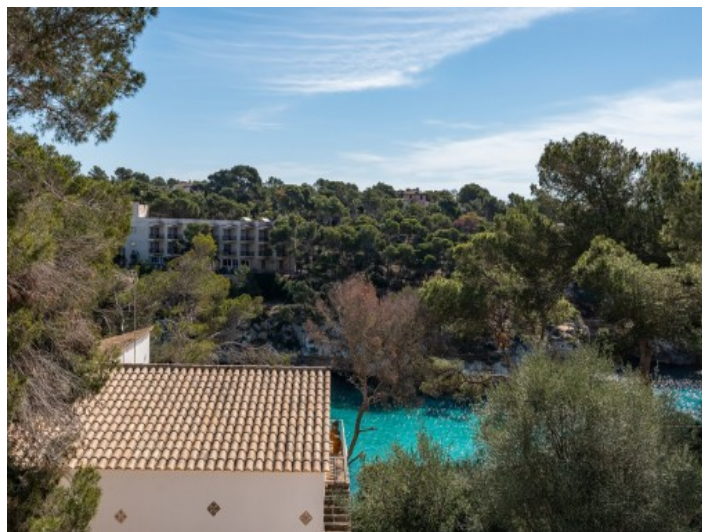
Beautiful sea views