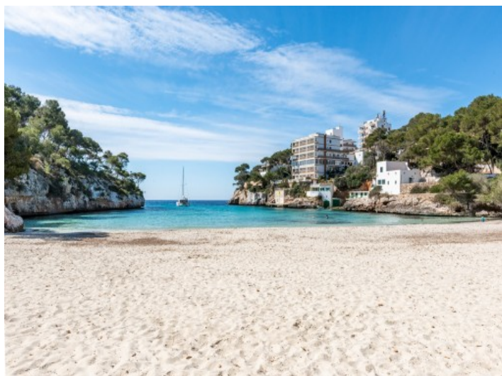
Beach of Cala Santanyi

All information is correct to the best of our knowledge. Errors and prior sale excepted. This prospectus is purely for information purposes. Only the notarized deed of sale is legally binding.