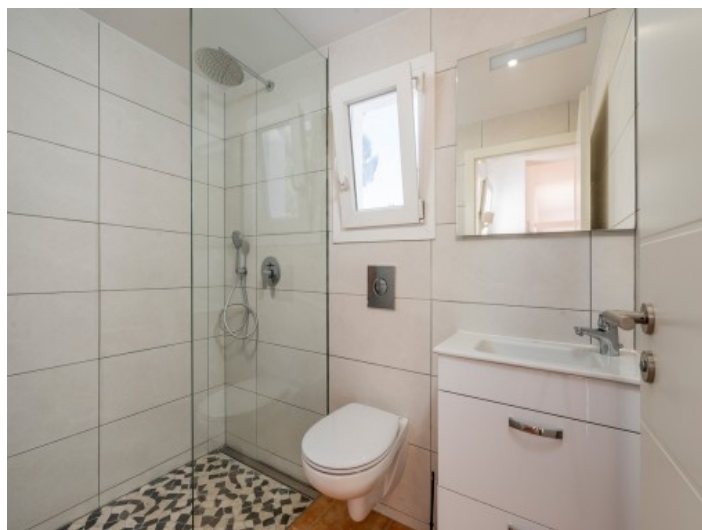
New shower bathroom

All information is correct to the best of our knowledge. Errors and prior sale excepted. This prospectus is purely for information purposes. Only the notarized deed of sale is legally binding.