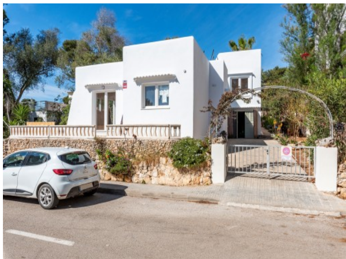
Exterior view from the street