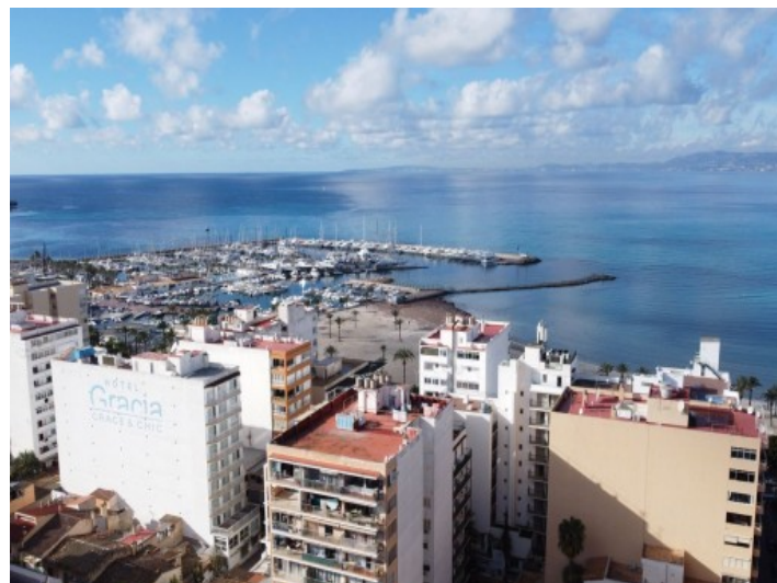
View over S'Arenal