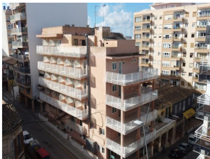
Side view of the building