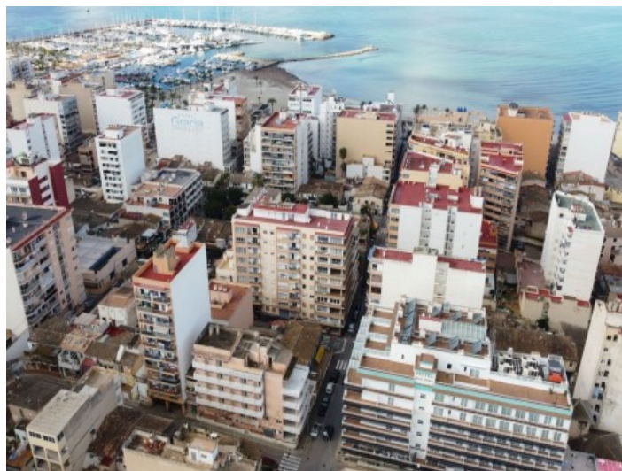
Birds' eye view of the location