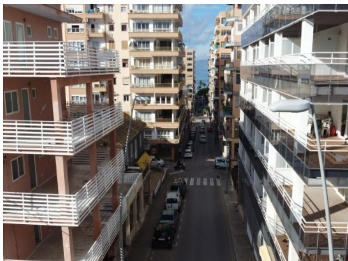
View of the street