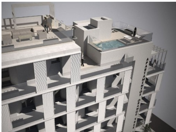
Building with pool on the roof