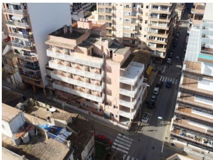
Birds' eye view of the location