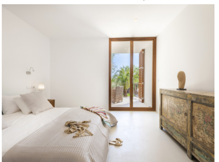
One of 5 bedrooms