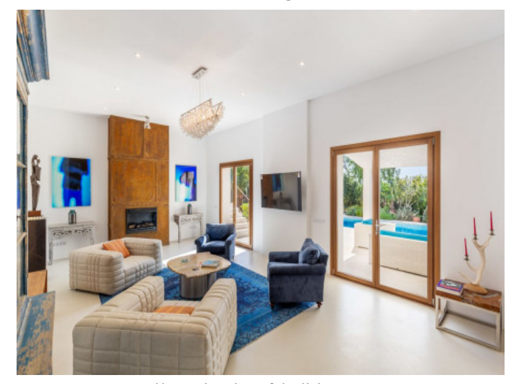
Alternative view of the living area