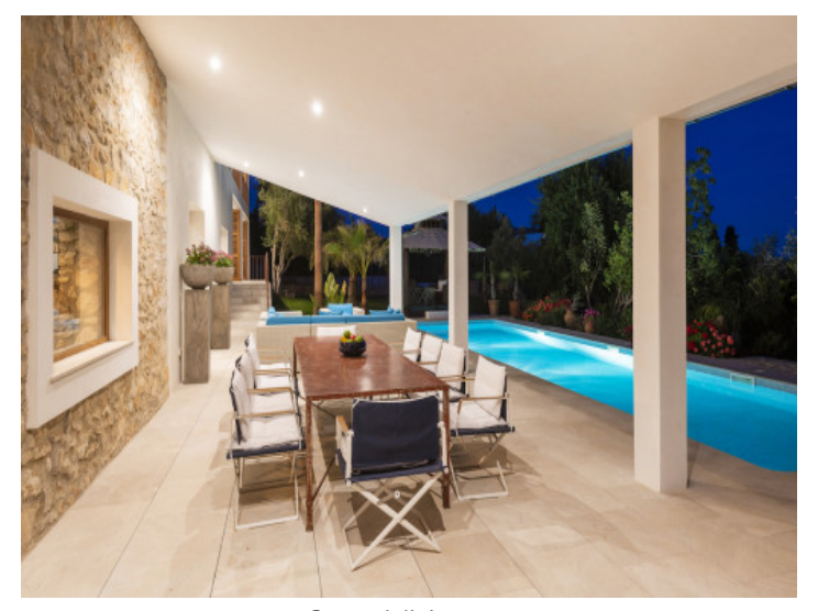
Covered dining area