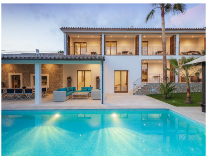
Exterior view of the villa