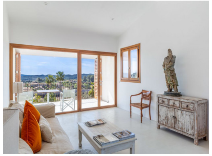
Separate living area