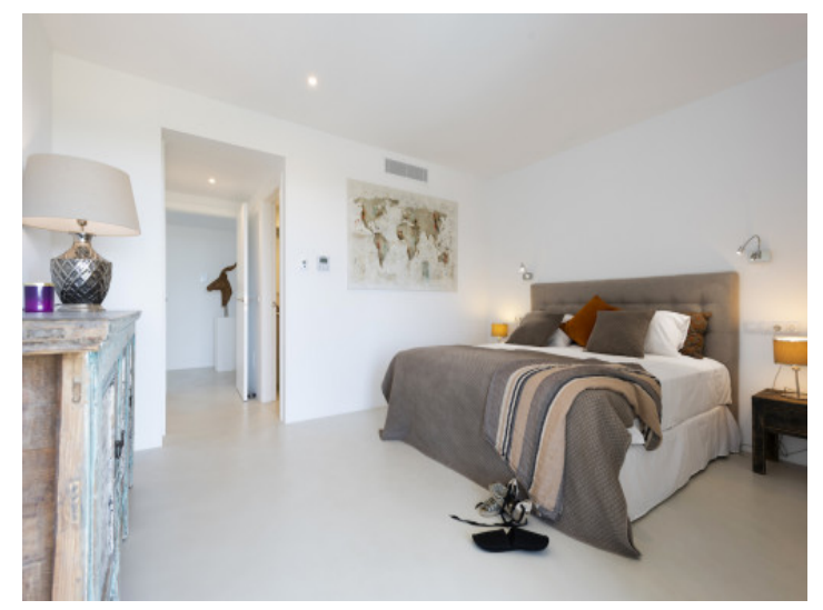
One of 5 bedrooms