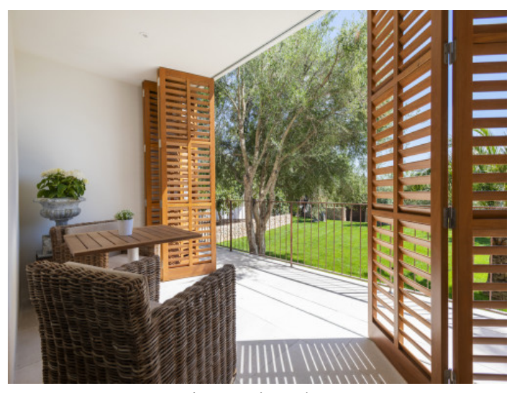
Access to the garden

All information is correct to the best of our knowledge. Errors and prior sale excepted. This prospectus is purely for information purposes. Only the notarized deed of sale is legally binding.