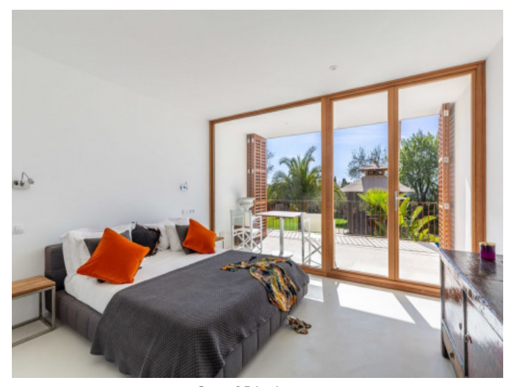
One of 5 bedrooms