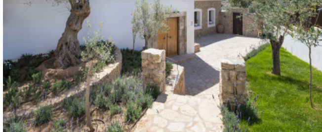
Access and entrance area

All information is correct to the best of our knowledge. Errors and prior sale excepted. This prospectus is purely for information purposes. Only the notarized deed of sale is legally binding.