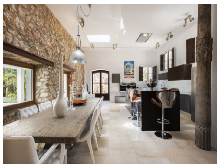
Open kitchen and dining area

All information is correct to the best of our knowledge. Errors and prior sale excepted. This prospectus is purely for information purposes. Only the notarized deed of sale is legally binding.