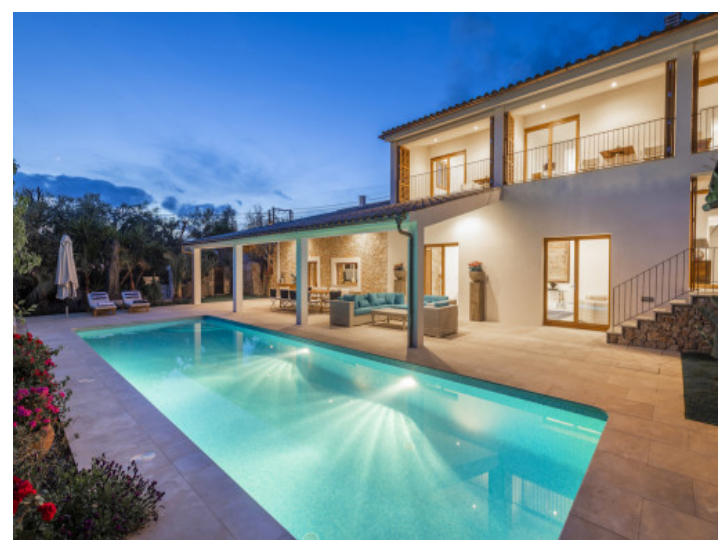
The pool by night