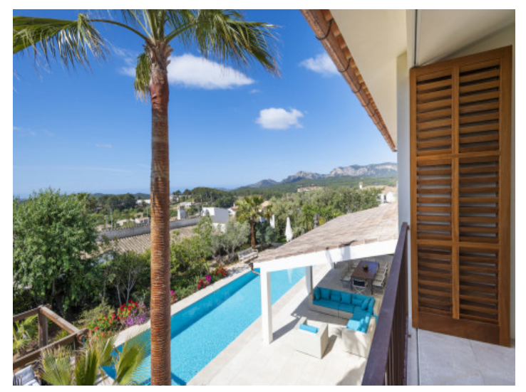
Pool view from the balcony