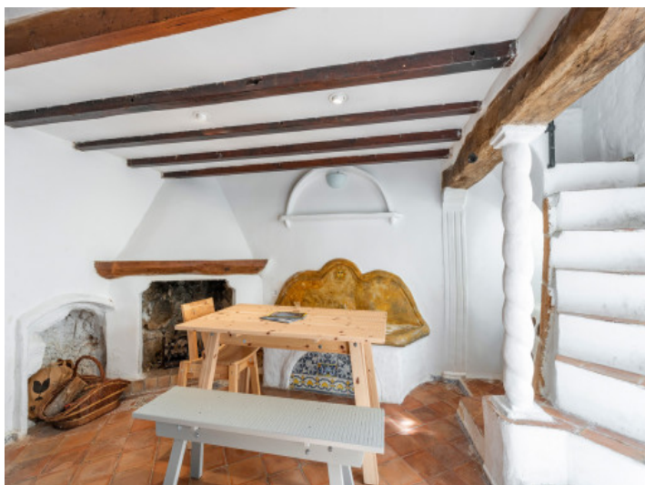
Further dining area with fireplace