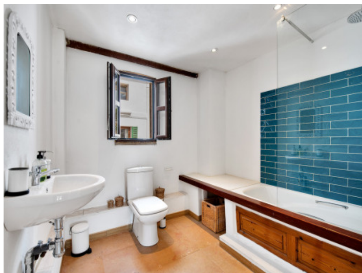
Second bathroom with bathtub

All information is correct to the best of our knowledge. Errors and prior sale excepted. This prospectus is purely for information purposes. Only the notarized deed of sale is legally binding.