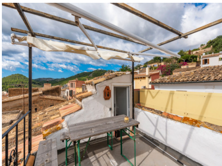
Roof terrace with fantastic views