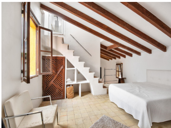
Access to the roof terrace