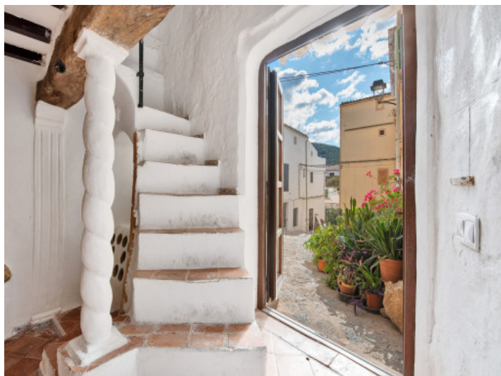
Second entrance door