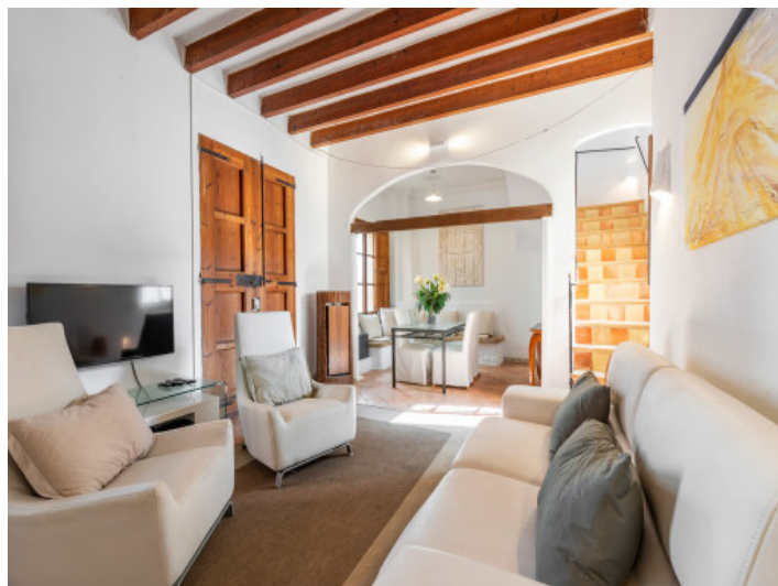
Modern living area and entrance door