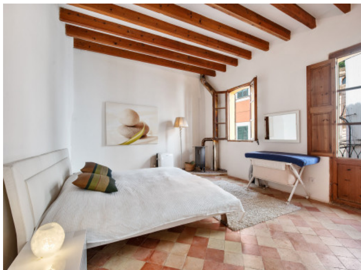
Double bedroom with oven