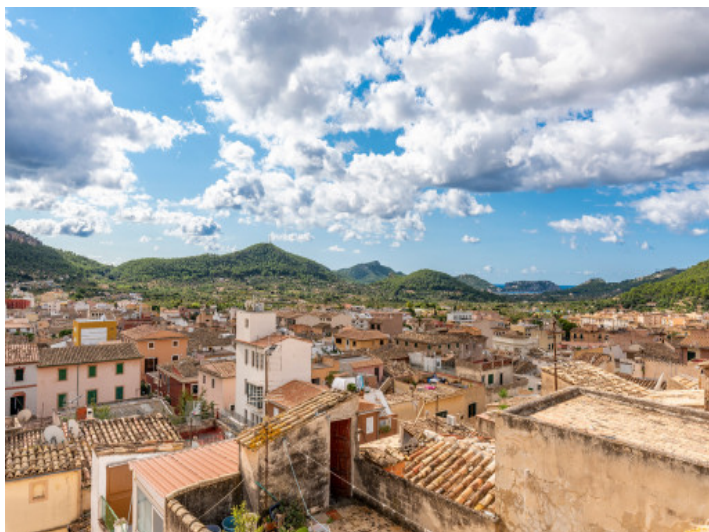
Sweeping views as far as Puerto Andratx