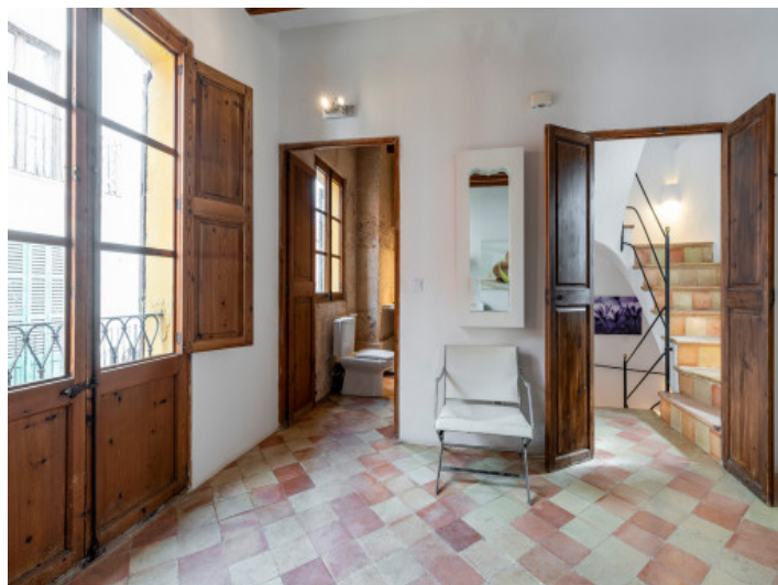
View to the bathroom en suite