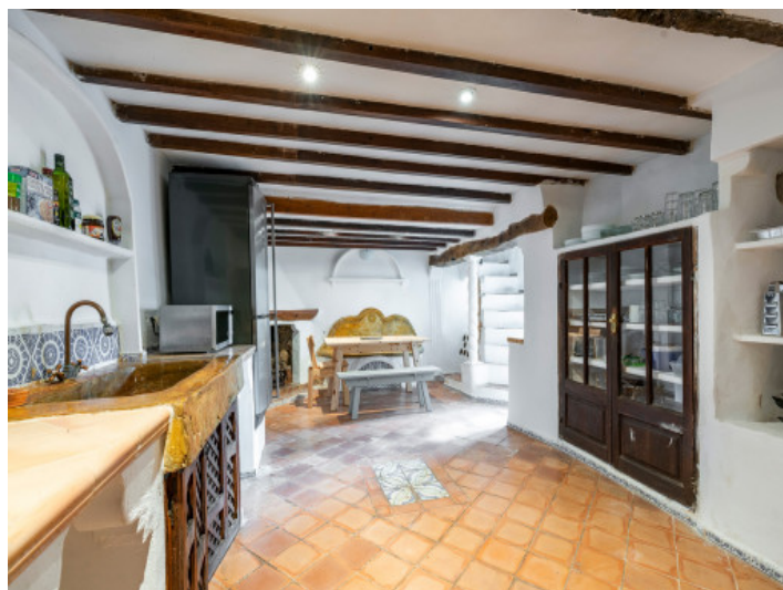
Rustic kitchen on the lower floor

All information is correct to the best of our knowledge. Errors and prior sale excepted. This prospectus is purely for information purposes. Only the notarized deed of sale is legally binding.