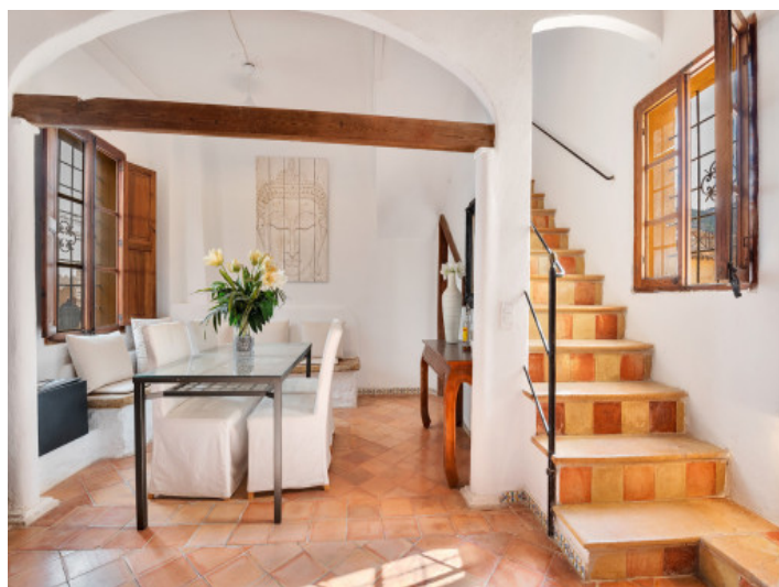
Dining area and staircase