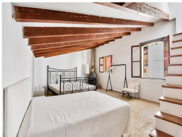
Second bedroom with ample space