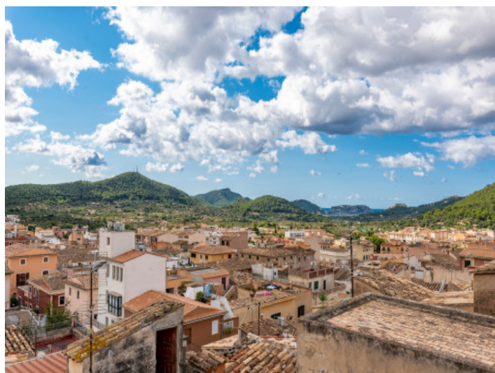
Dreamlike views over the town