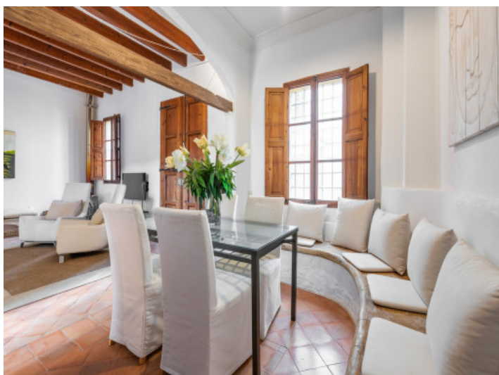
Beautiful dining area