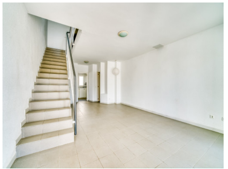
Access to the upper floor Lightflooded kitchen All information is correct to the best of our knowledge. Errors and prior sale excepted. This prospectus is purely for information purposes. Only the notarized deed of sale is legally binding.

PORTA MALLORQUINA • C./ CONQUISTADOR 8, 07001 PALMA TEL. +34 971 698 242 • INFO@PORTAMALLORQUINA.COM