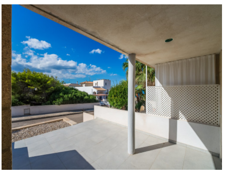
Partly covered terrace