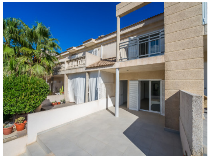
Front terrace and access to the house