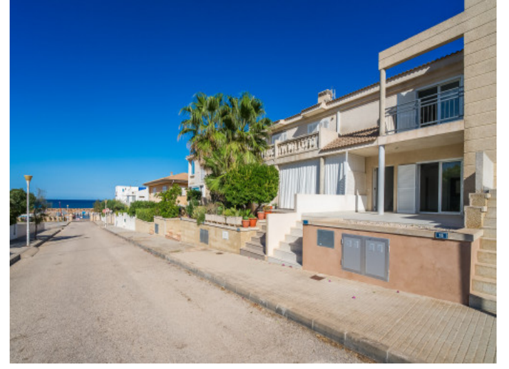
Street and exterior view

PORTA MALLORQUINA® Your home. Our passion.