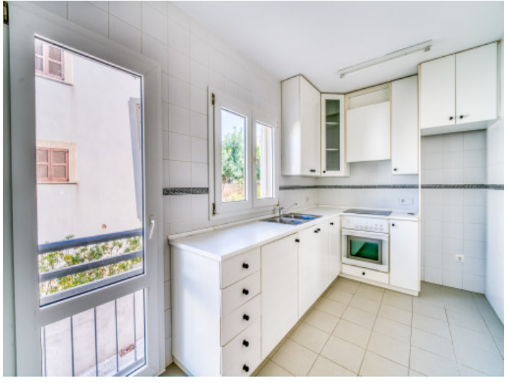
Alternative kitchen view

PORTA MALLORQUINA® Your home. Our passion.