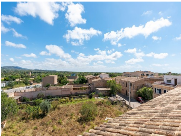
Fantastic panoramic views