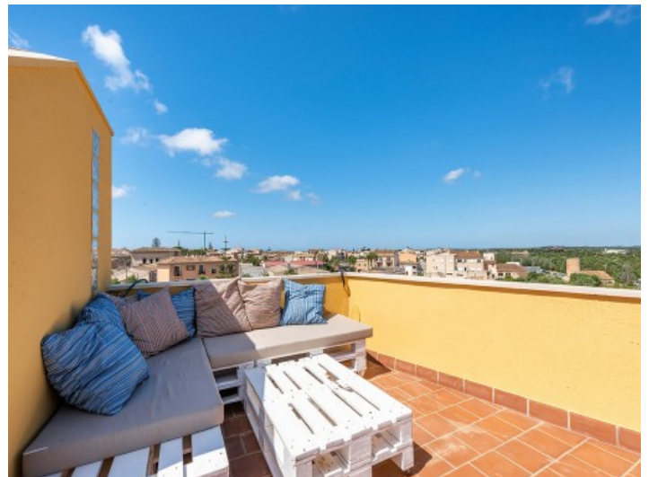
Lovely roof terrace with lounge area