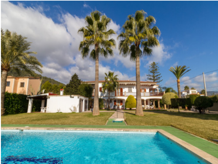
Sunny pool area with palm trees