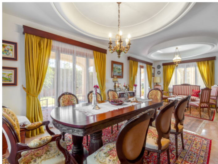
Bright and spacious dining area