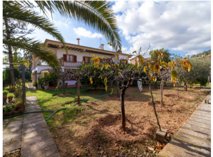
Garden with fruit trees