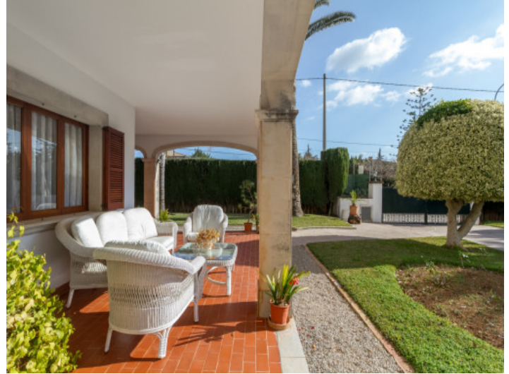
Further covered terrace