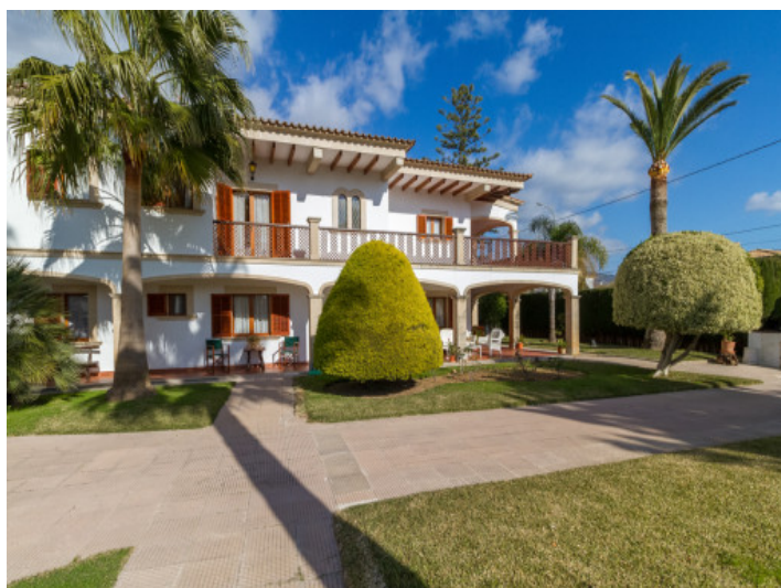
Exterior view and garden