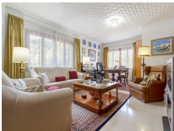
Appealing living and working area

All information is correct to the best of our knowledge. Errors and prior sale excepted. This prospectus is purely for information purposes. Only the notarized deed of sale is legally binding.