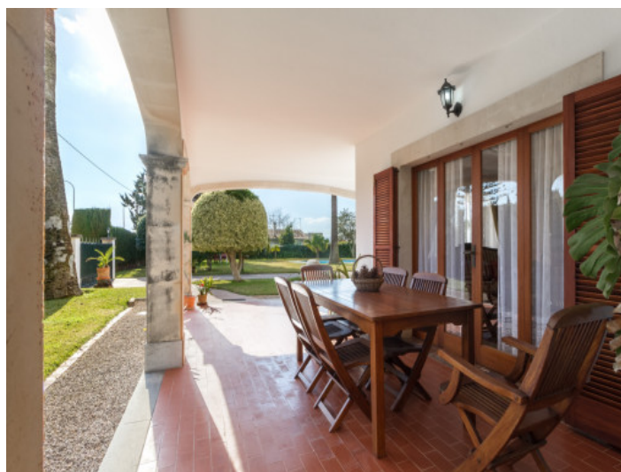
Wonderful dining area on the terrace