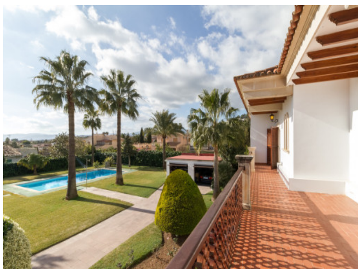
Spacious pool area