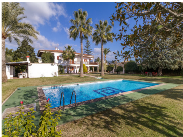
Exterior view and pool area