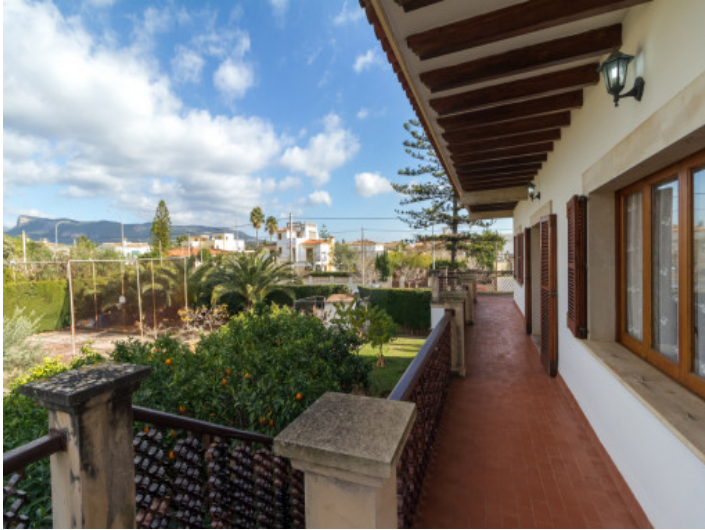
Garden area with fruit trees