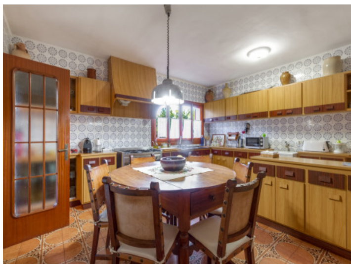
Further dining area in the kitchen