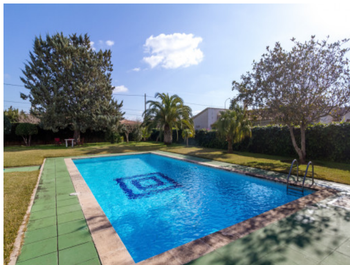
Large pool area