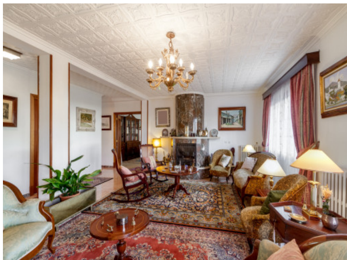
Unique living area with fireplace