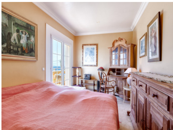
The villa offers 3 bedrooms