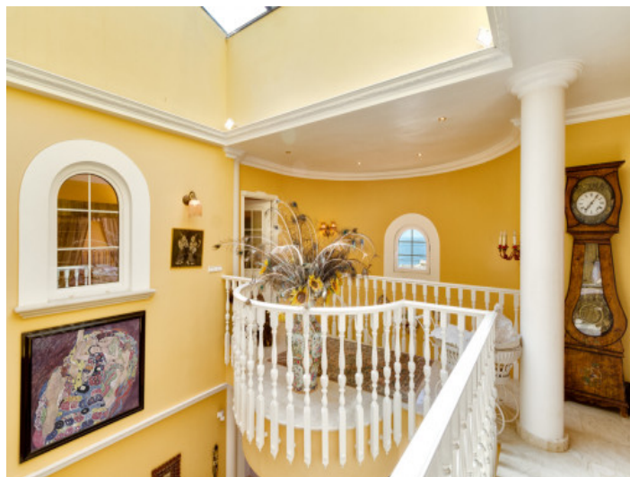
Views of the gallery