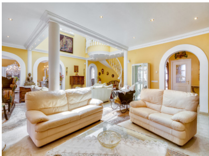
Various seating areas