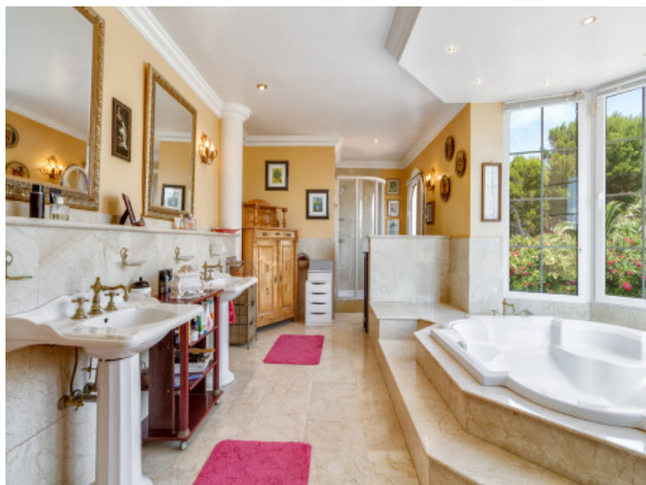
The bathroom is flooded with daylight