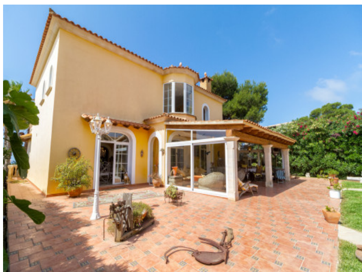
Exterior views and garden