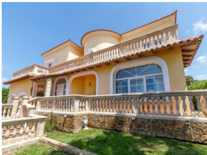
Impressive exterior views of the property