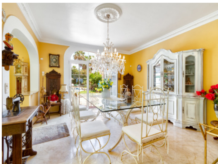
Garden access from the kitchen area