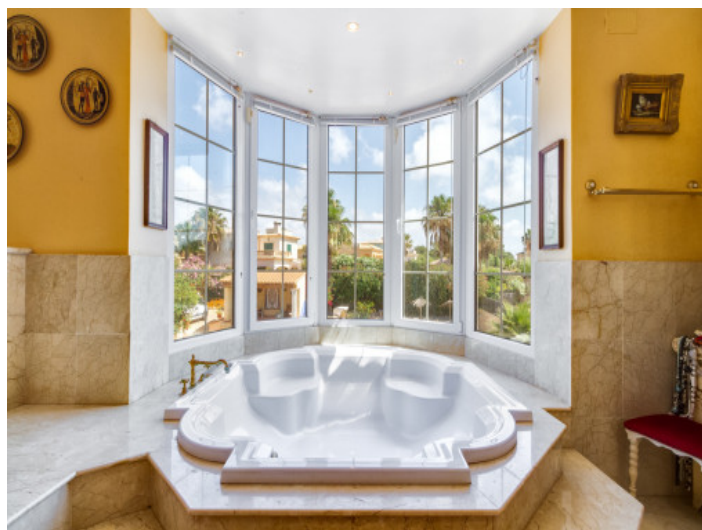
Noble bathroom with jacuzzi

All information is correct to the best of our knowledge. Errors and prior sale excepted. This prospectus is purely for information purposes. Only the notarized deed of sale is legally binding.