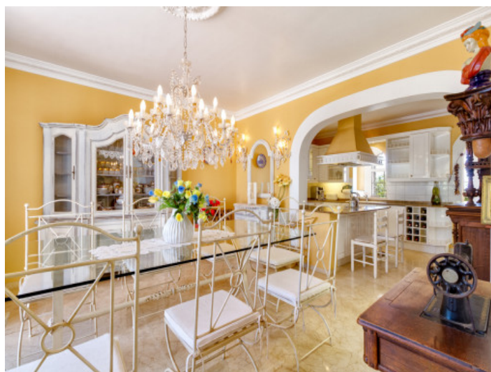
Dining area next to the kitchen