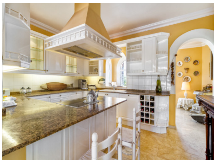
Fully equipped kitchen with cooking island