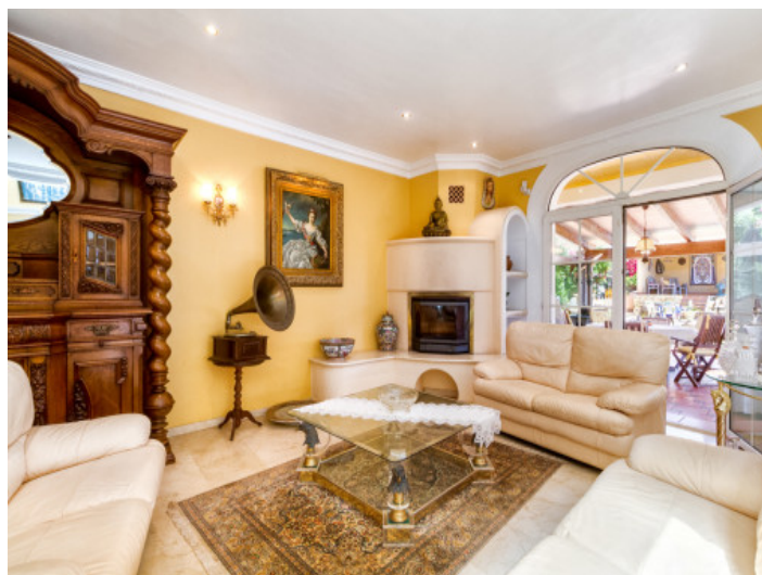
Cosy fireplace in the lounge area

All information is correct to the best of our knowledge. Errors and prior sale excepted. This prospectus is purely for information purposes. Only the notarized deed of sale is legally binding.