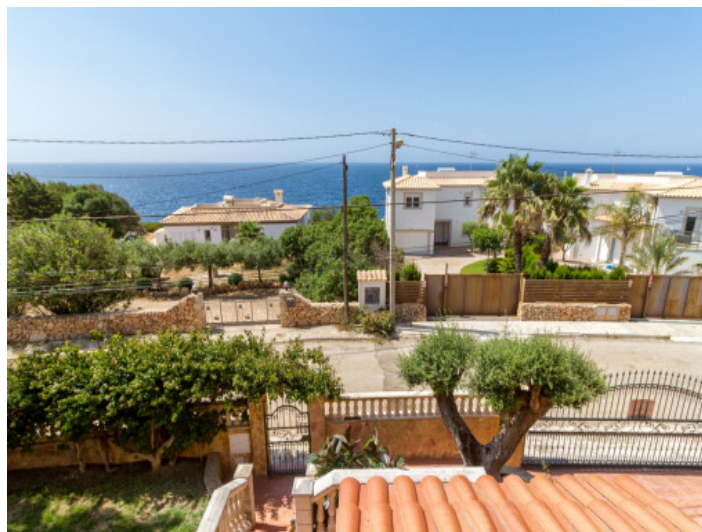
Sea views from the balcony