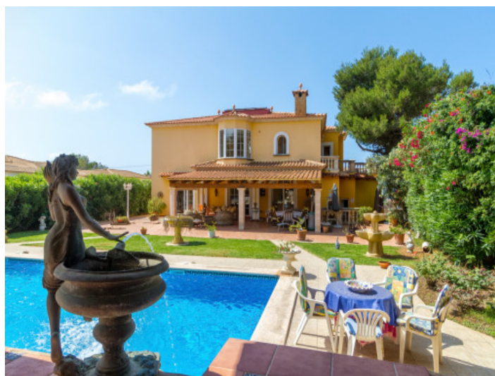
Inviting sun loungers at the pool area