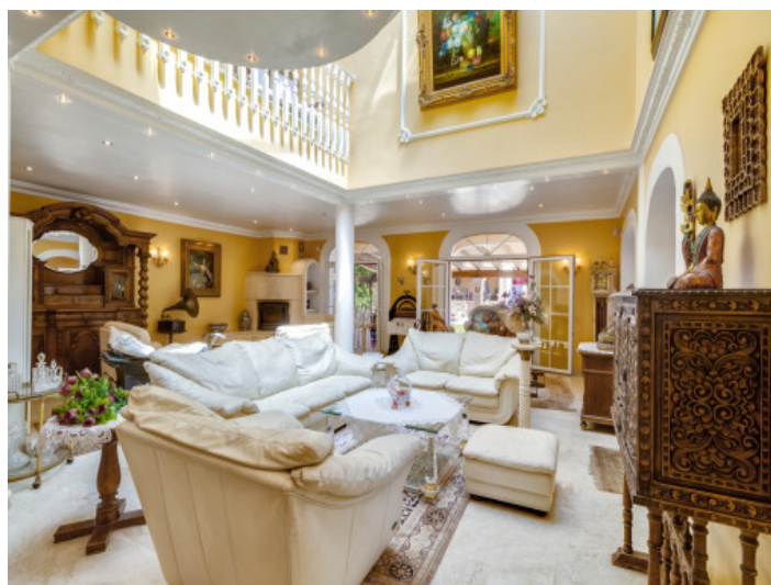
Open living area and gallery