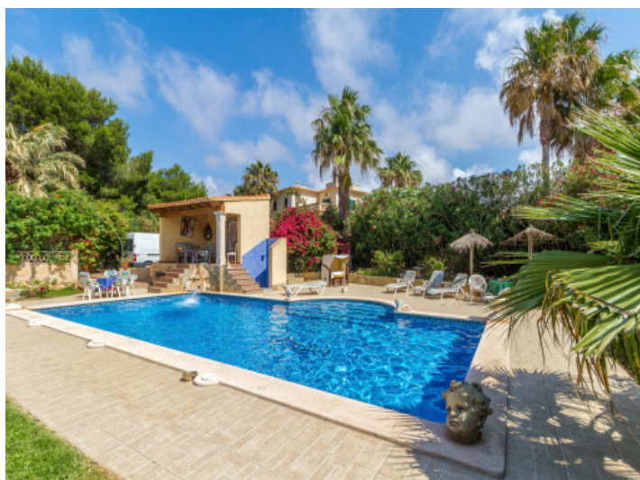
Sunny pool area and pool terrace