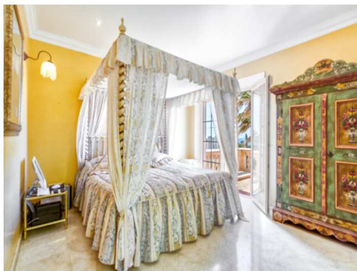
Master bedroom with access to the balcony