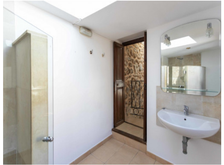
Bathroom first floor