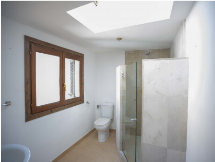
Bathroom first floor