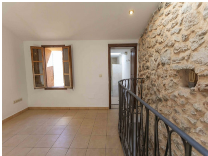
Vestibule main bedroom