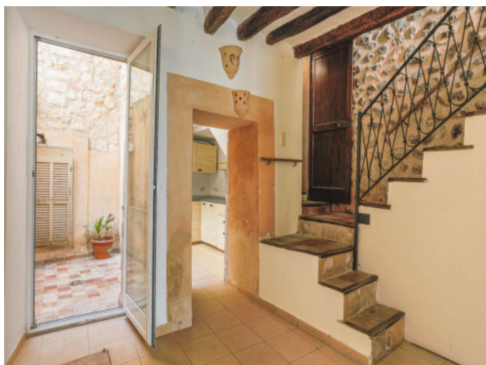
Dining, kitchen and small patio area