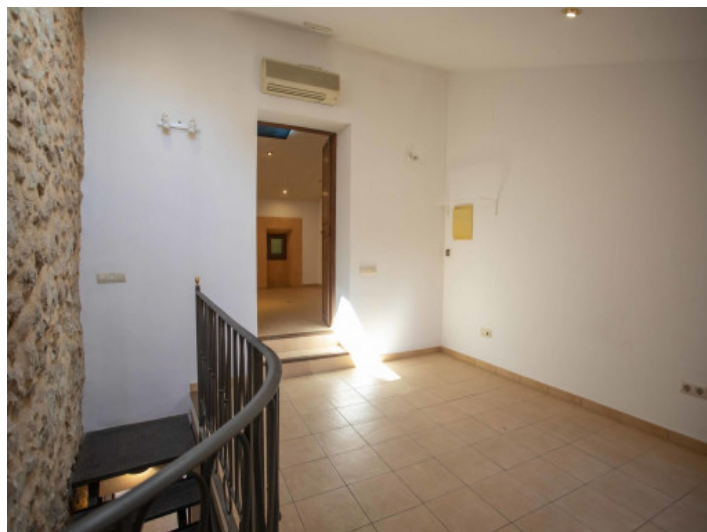
Vestibule main bedroom