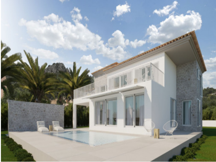
Villa with pool