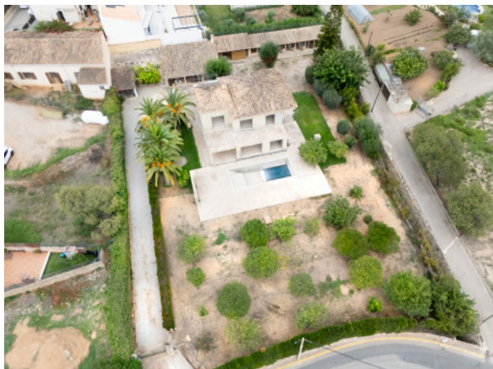
The villa and plot