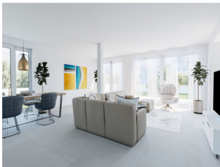
Living and dining area