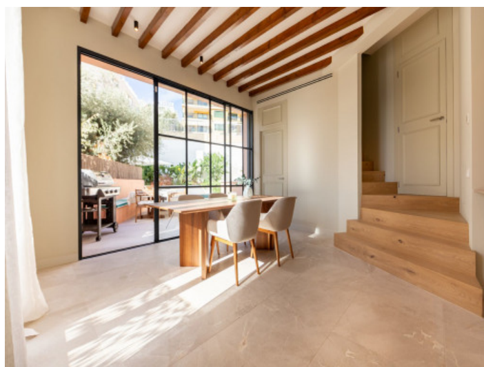
Dining area with patio views

All information is correct to the best of our knowledge. Errors and prior sale excepted. This prospectus is purely for information purposes. Only the notarized deed of sale is legally binding.