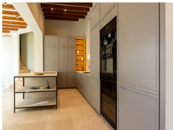
Kitchen with plenty of storage space

All information is correct to the best of our knowledge. Errors and prior sale excepted. This prospectus is purely for information purposes. Only the notarized deed of sale is legally binding.