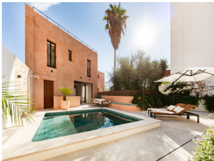
Pool and patio