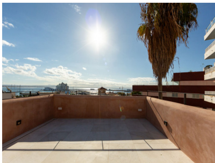
Rooftop with amazing views