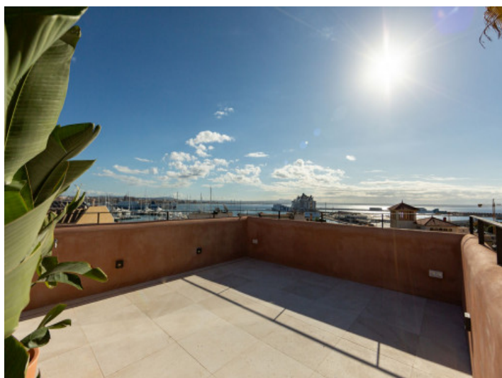
Rooftop terrace with harbour views