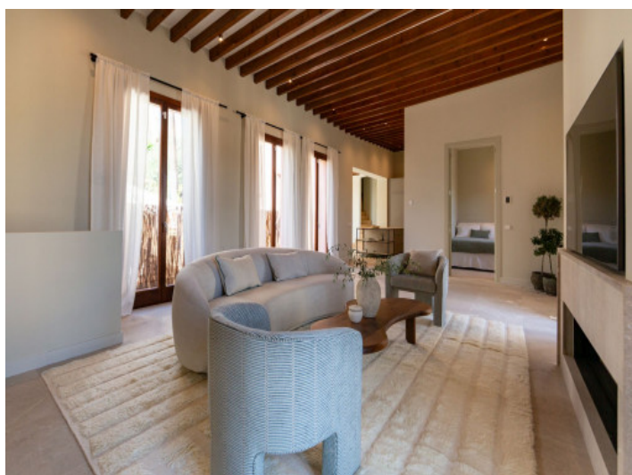
Comfortable living area