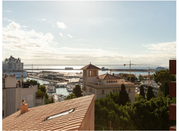
Amazing rooftop views

All information is correct to the best of our knowledge. Errors and prior sale excepted. This prospectus is purely for information purposes. Only the notarized deed of sale is legally binding.