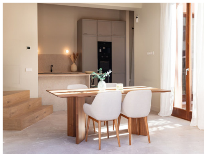
Dining area close to the kitchen