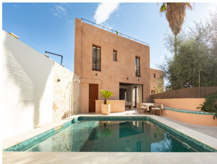
Pool and façade

All information is correct to the best of our knowledge. Errors and prior sale excepted. This prospectus is purely for information purposes. Only the notarized deed of sale is legally binding.