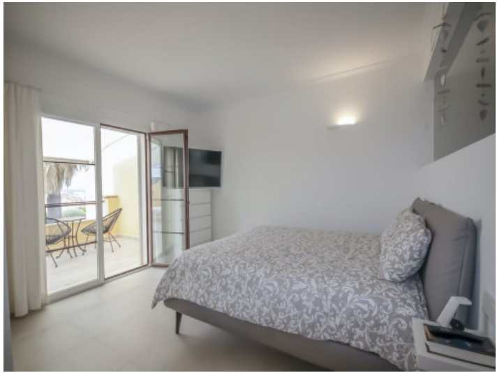
Sitting area Bedroom All information is correct to the best of our knowledge. Errors and prior sale excepted. This prospectus is purely for information purposes. Only the notarized deed of sale is legally binding.

PORTA MALLORQUINA • C./ CONQUISTADOR 8, 07001 PALMA TEL. +34 971 698 242 • INFO@PORTAMALLORQUINA.COM