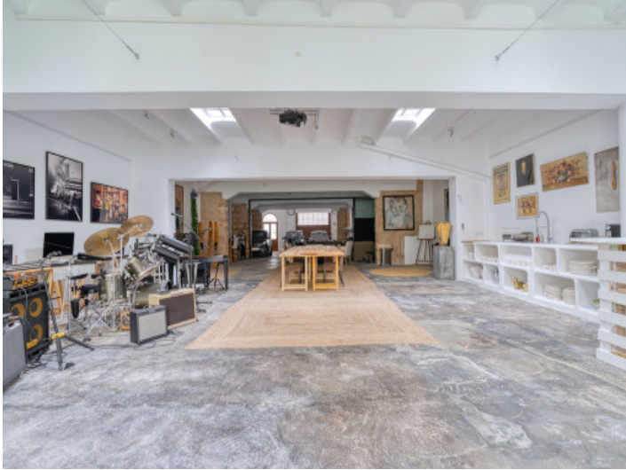
Spacious garage and hobby room