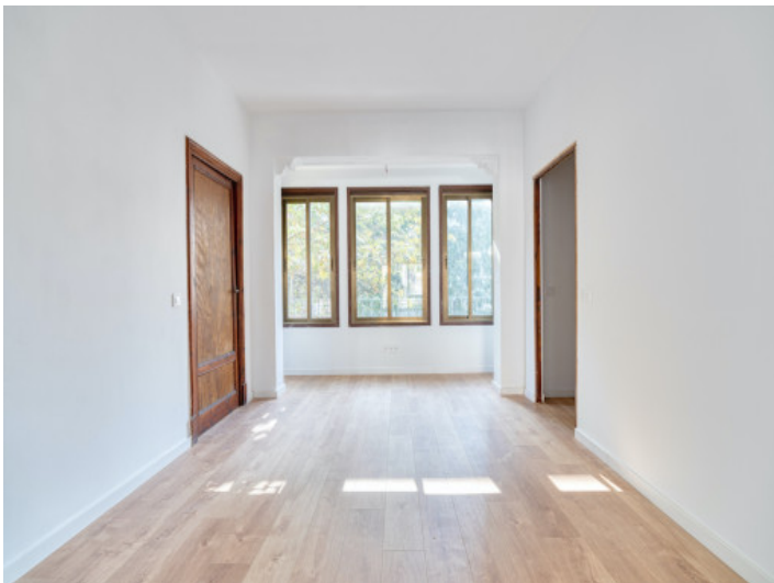
Access to the bedroom