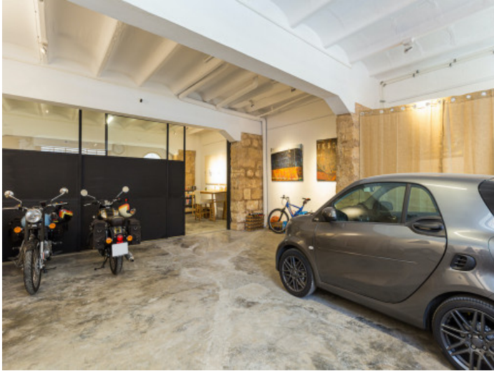
Alternative view of the garage