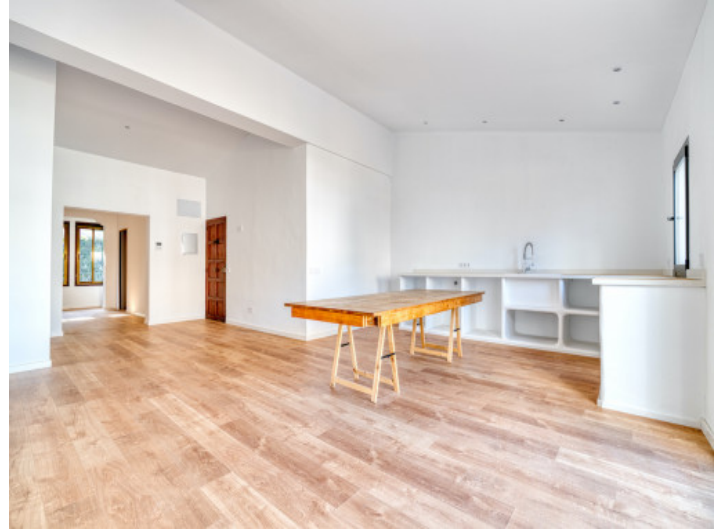
Living and dining area on the upper floor