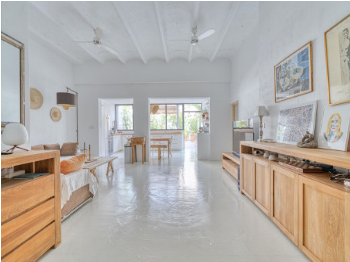
Open living and dining area of 1st floor