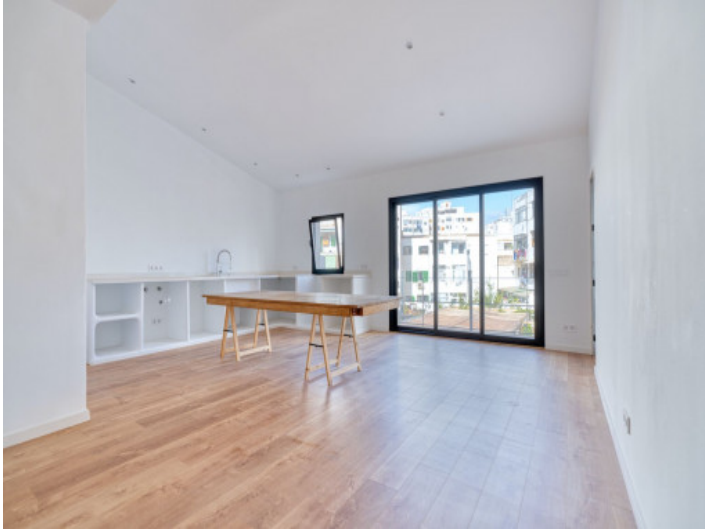
Living and dining area on the upper floor