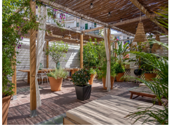
Terrace on the upper floor