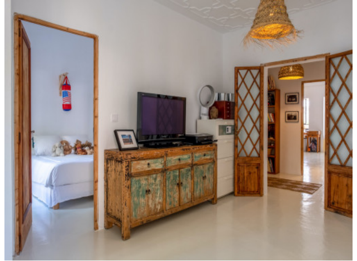
View to the bedroom