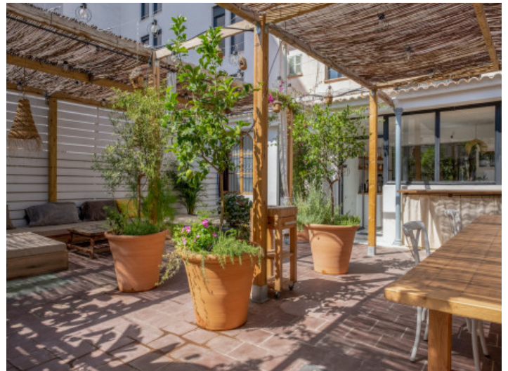
Green terrace with dining area

All information is correct to the best of our knowledge. Errors and prior sale excepted. This prospectus is purely for information purposes. Only the notarized deed of sale is legally binding.