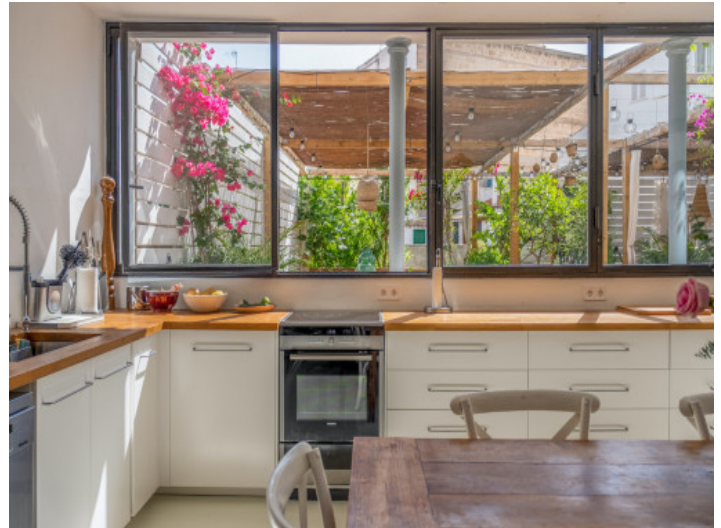
Kitchen with views to the terrace