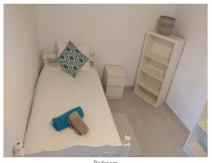
Bedroom All information is correct to the best of our knowledge. Errors and prior sale excepted. This prospectus is purely for information purposes. Only the notarized deed of sale is legally binding.

PORTA MALLORQUINA • C./ CONQUISTADOR 8, 07001 PALMA TEL. +34 971 698 242 • INFO@PORTAMALLORQUINA.COM