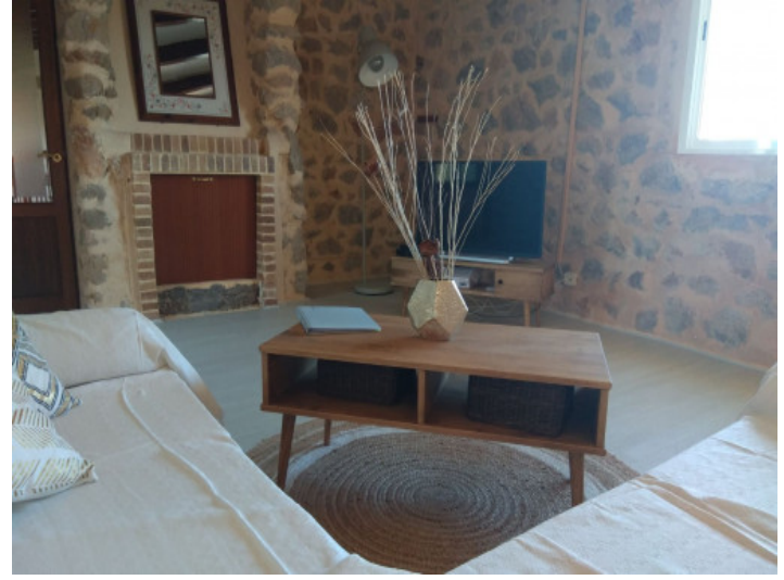
Living area Living area All information is correct to the best of our knowledge. Errors and prior sale excepted. This prospectus is purely for information purposes. Only the notarized deed of sale is legally binding.

PORTA MALLORQUINA • C./ CONQUISTADOR 8, 07001 PALMA TEL. +34 971 698 242 • INFO@PORTAMALLORQUINA.COM