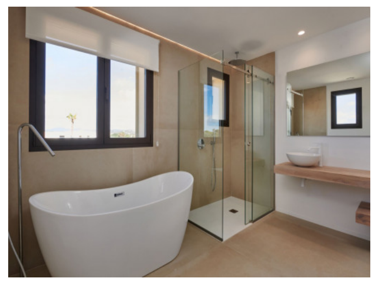
One of 3 bathrooms

PORTA MALLORQUINA® Your home. Our passion.