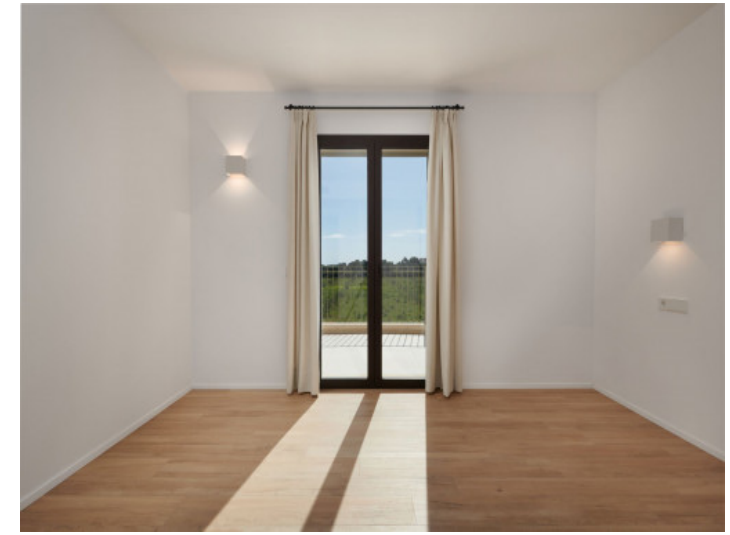
One of 4 bedrooms