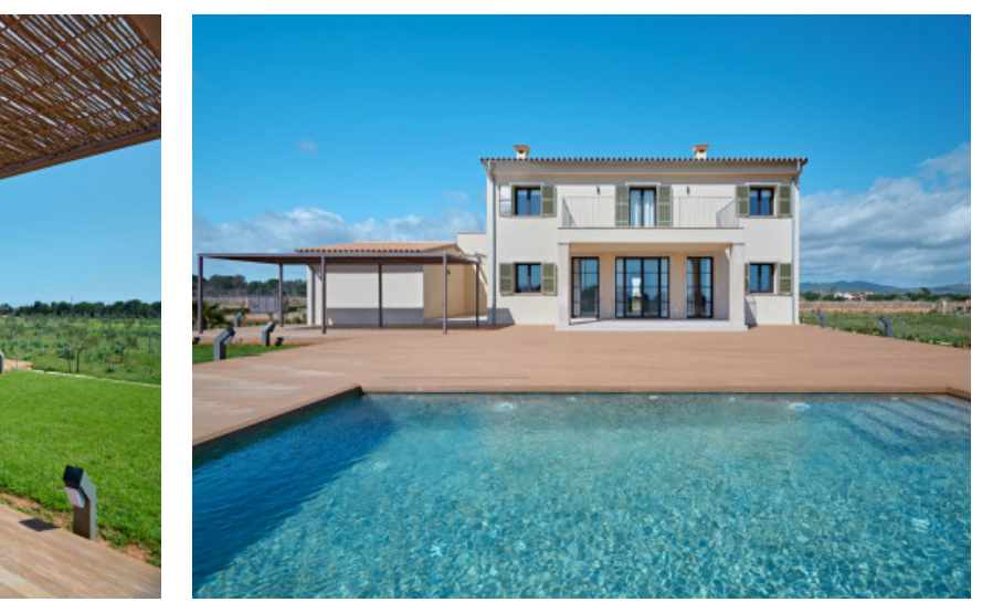
Covered terrace Pool area All information is correct to the best of our knowledge. Errors and prior sale excepted. This prospectus is purely for information purposes. Only the notarized deed of sale is legally binding.