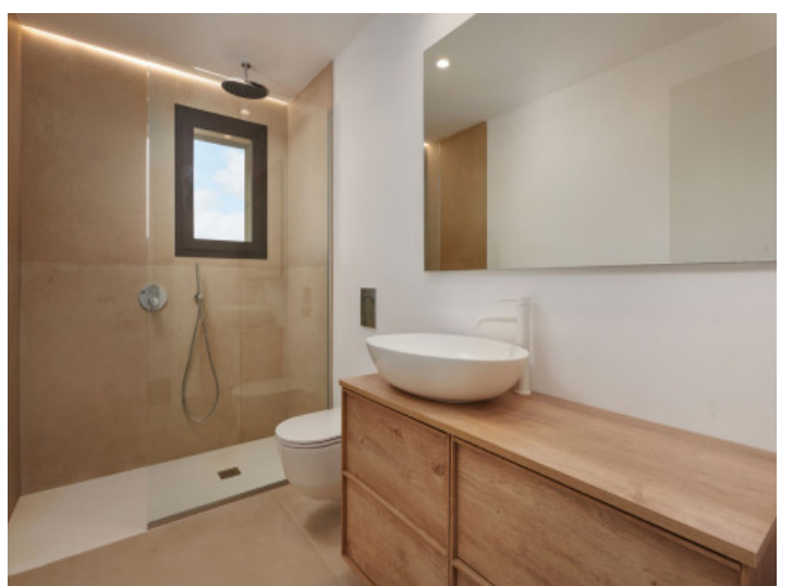
Walk in shower Bright bedroom All information is correct to the best of our knowledge. Errors and prior sale excepted. This prospectus is purely for information purposes. Only the notarized deed of sale is legally binding.