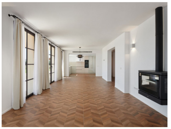
Living and dining area