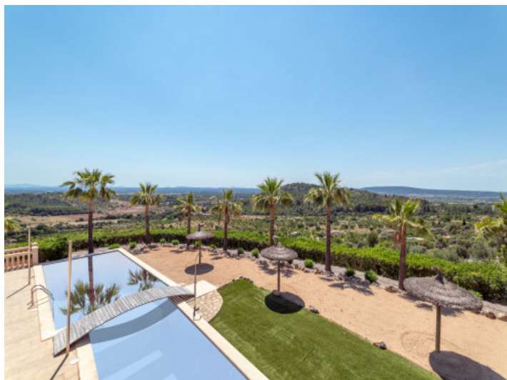
Large finca property with panoramic views in Alaro