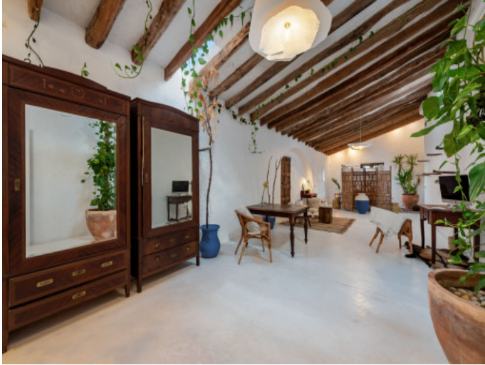
Room on the first floor