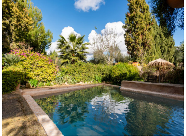
Old water basin converted into a pool