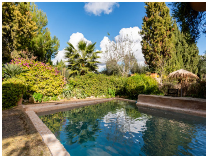
Old water basin converted into a pool