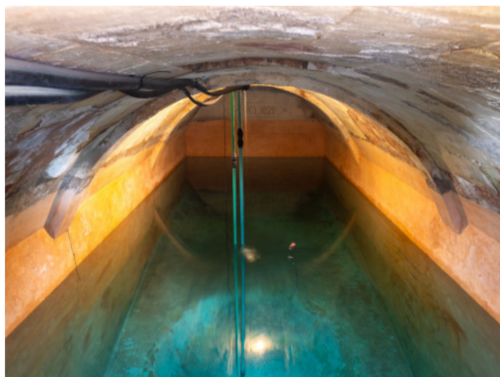
Underground waterbasin from 1829

All information is correct to the best of our knowledge. Errors and prior sale excepted. This prospectus is purely for information purposes. Only the notarized deed of sale is legally binding.