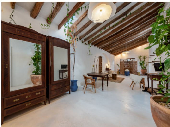
Room on the first floor