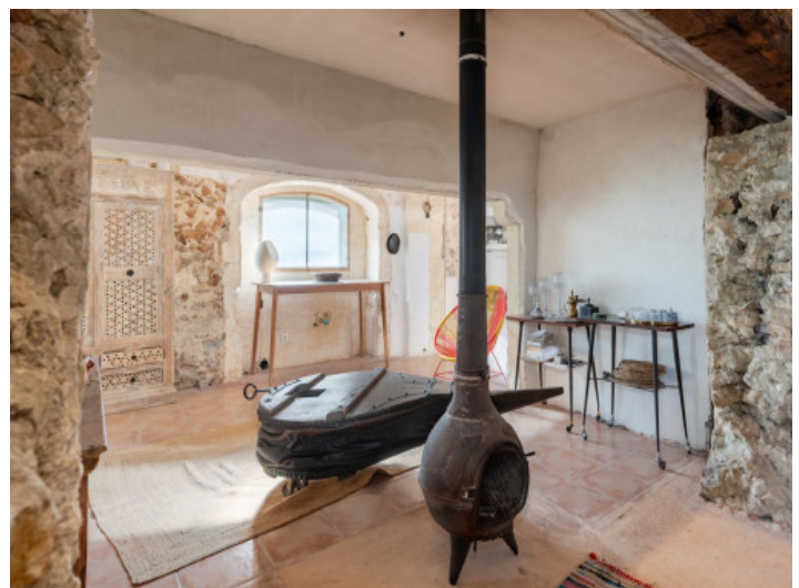
Fireplace corner at the dining area

All information is correct to the best of our knowledge. Errors and prior sale excepted. This prospectus is purely for information purposes. Only the notarized deed of sale is legally binding.