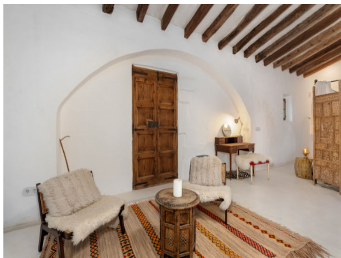
High ceilings and restored wooden beams

All information is correct to the best of our knowledge. Errors and prior sale excepted. This prospectus is purely for information purposes. Only the notarized deed of sale is legally binding.