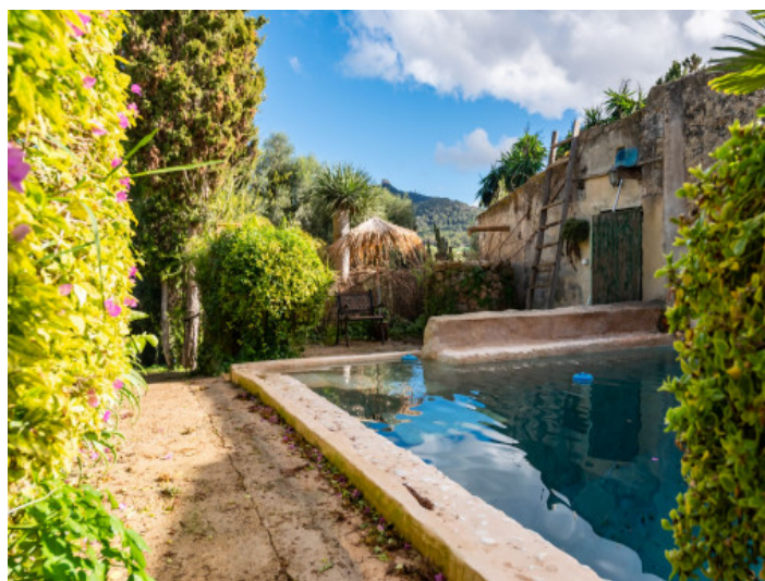
Beautiful pool area