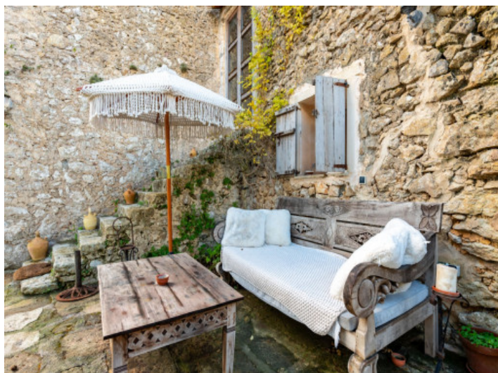
Cosy sitting area in the patio