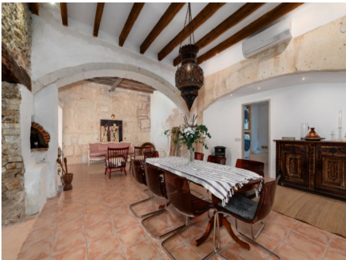
Amazing dining area