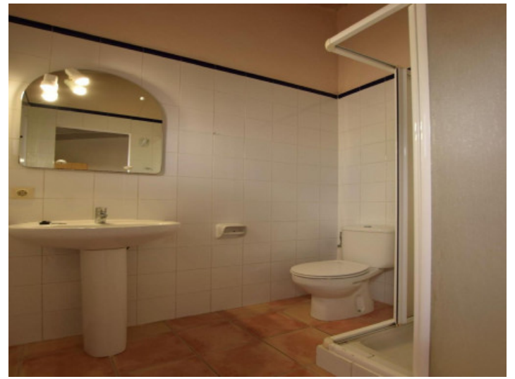
One of 10 bathrooms