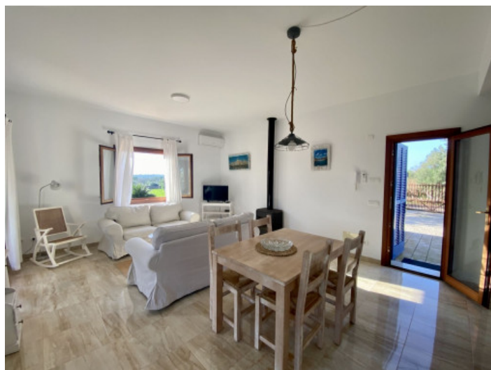
Finca with fireplace

All information is correct to the best of our knowledge. Errors and prior sale excepted. This prospectus is purely for information purposes. Only the notarized deed of sale is legally binding.