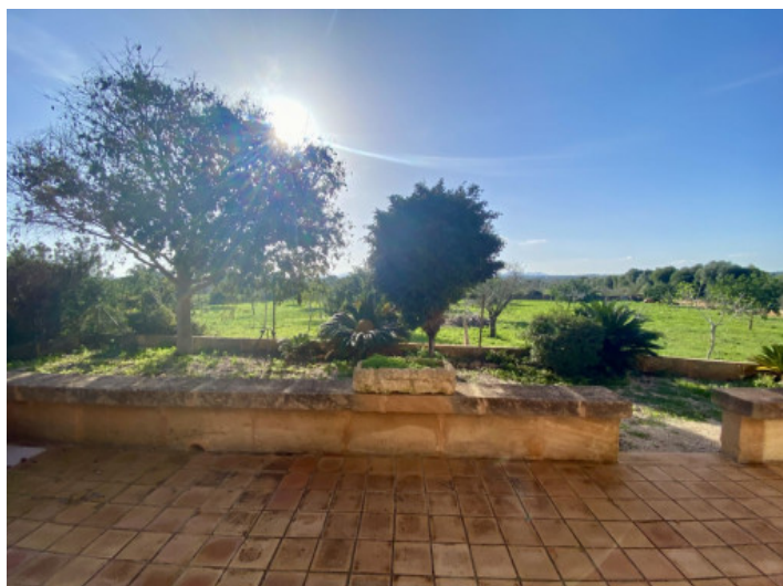
Embedded in nature

All information is correct to the best of our knowledge. Errors and prior sale excepted. This prospectus is purely for information purposes. Only the notarized deed of sale is legally binding.