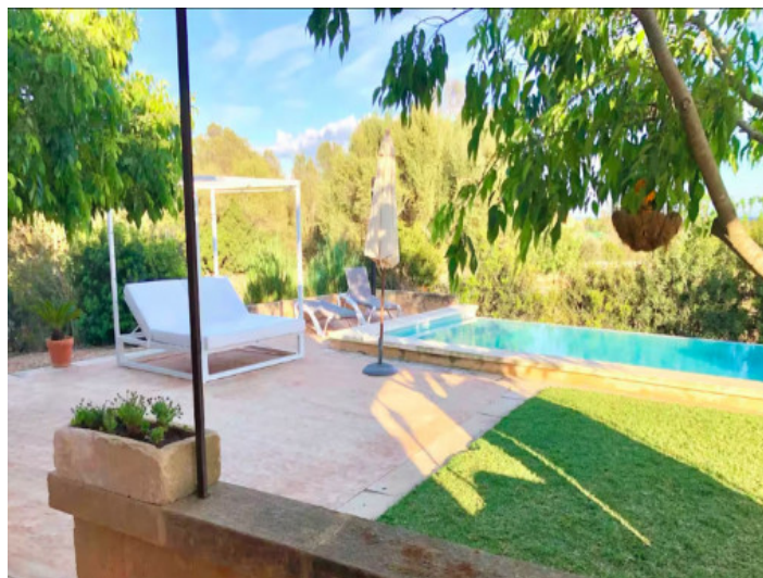
Pool and garden