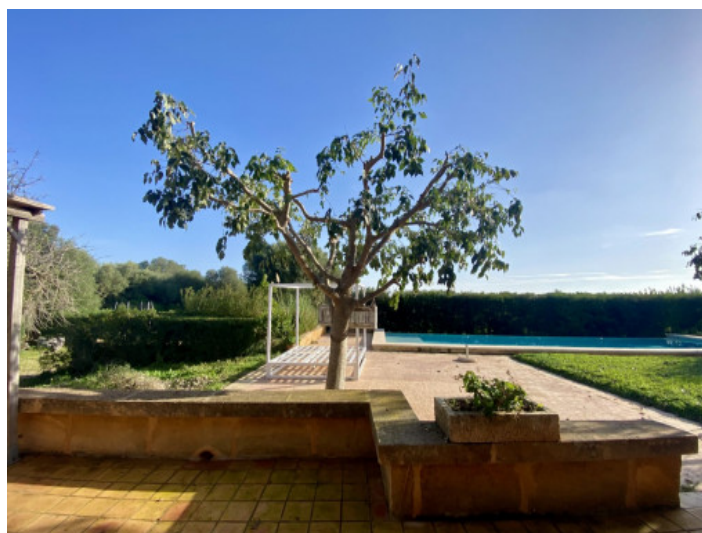
Garden and pool