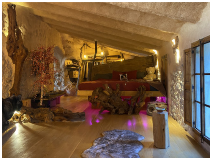
Living area and study

All information is correct to the best of our knowledge. Errors and prior sale excepted. This prospectus is purely for information purposes. Only the notarized deed of sale is legally binding.