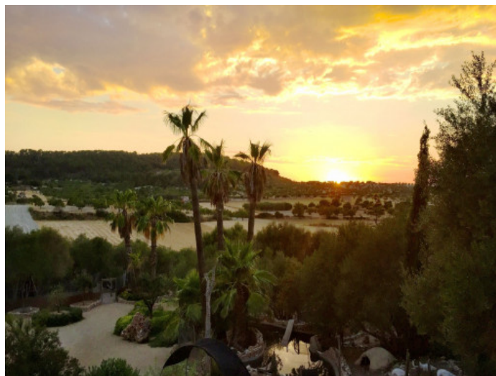
Finca Sant Joan