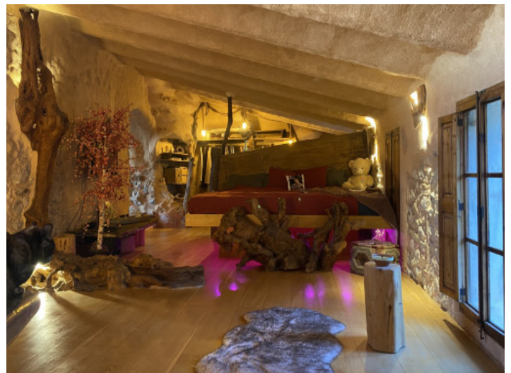
Living area and study

All information is correct to the best of our knowledge. Errors and prior sale excepted. This prospectus is purely for information purposes. Only the notarized deed of sale is legally binding.