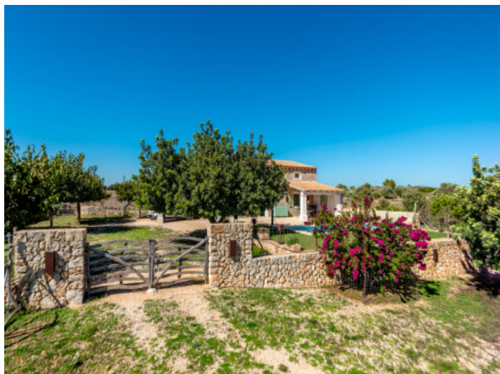
Entrance way to the finca