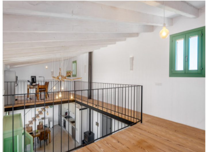
Study room 1. floor