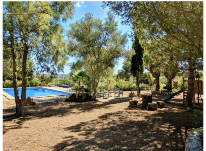
Garden and pool