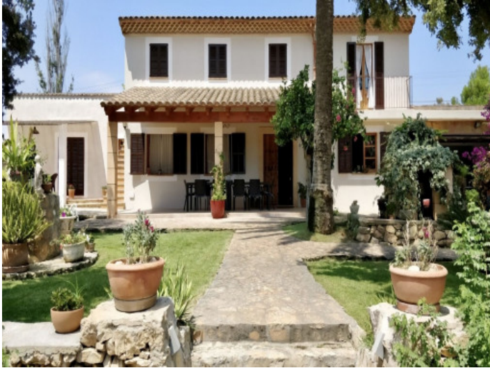
View to the finca