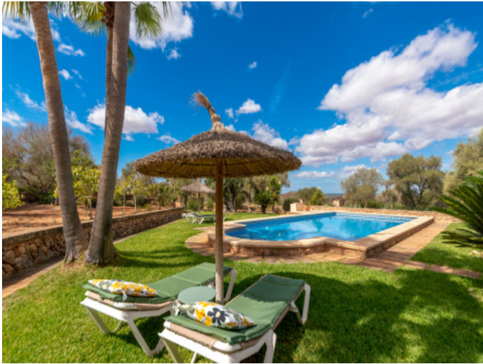
Very nice pool and garden area