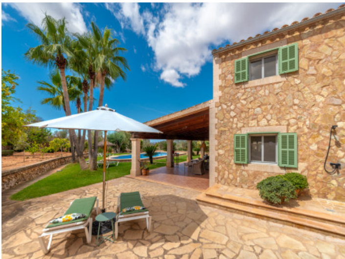
View to the lateral façade and garden