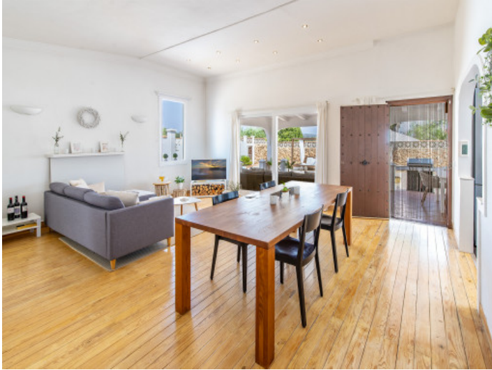
Dining and living area