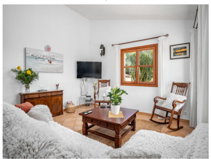
Living area Living and dining area All information is correct to the best of our knowledge. Errors and prior sale excepted. This prospectus is purely for information purposes. Only the notarized deed of sale is legally binding.