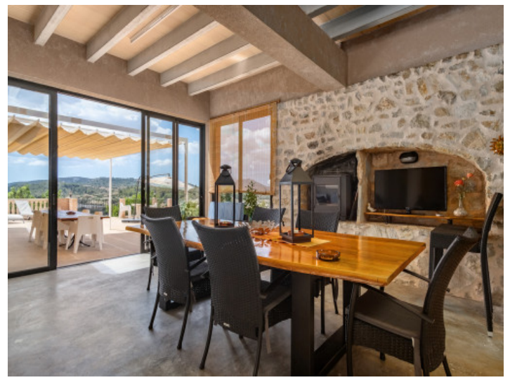
Conservatory Outdoor kitchen All information is correct to the best of our knowledge. Errors and prior sale excepted. This prospectus is purely for information purposes. Only the notarized deed of sale is legally binding.

PORTA MALLORQUINA • C./ CONQUISTADOR 8, 07001 PALMA TEL. +34 971 698 242 • INFO@PORTAMALLORQUINA.COM