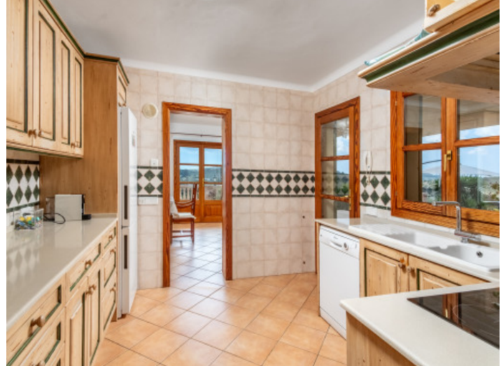
Country style kitchen