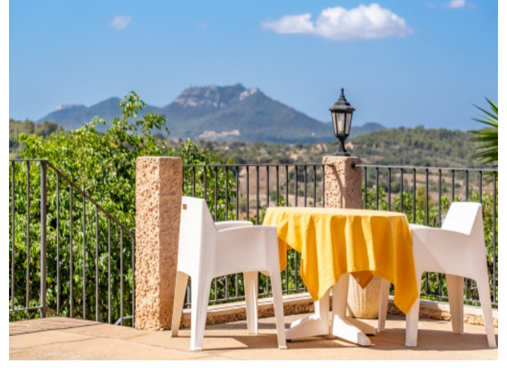
Join and relax