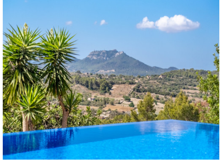
Incredible views up to Sant Salvador