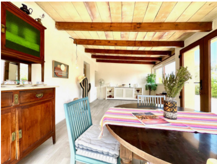
Charming dining area