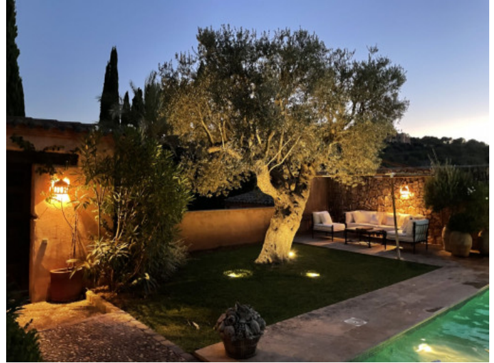
The finca by night