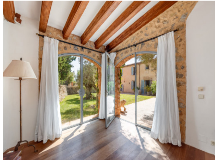
Fantastic garden views