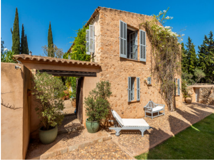
Facade of a typical mallorcan country home