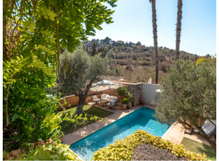
Romantic garden and pool