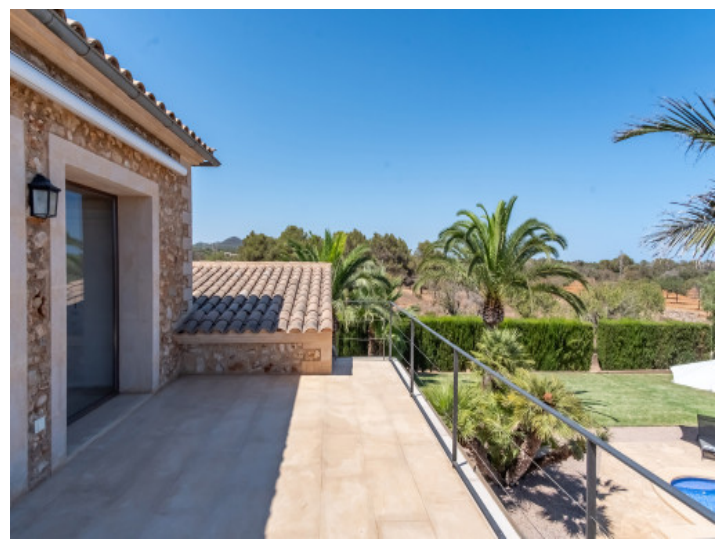
Terrace of the living area