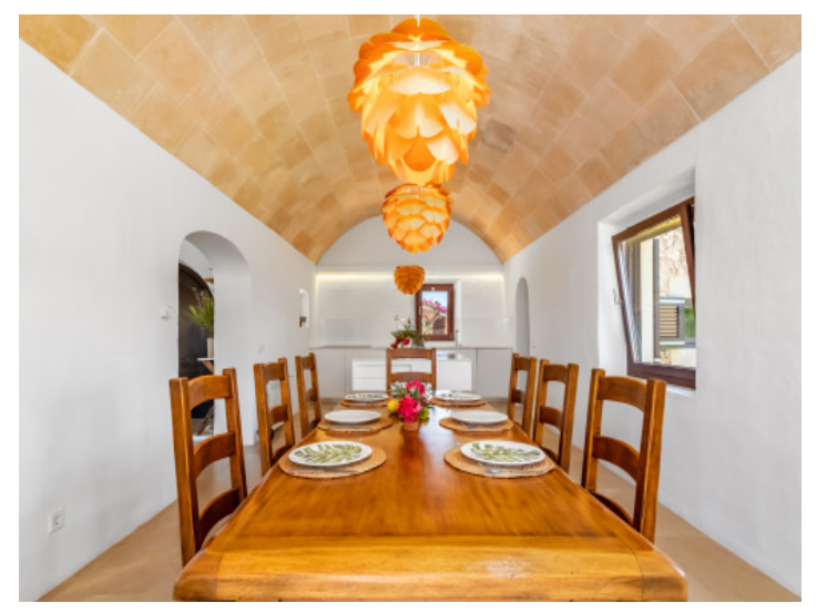
Dining area and sandstone vault