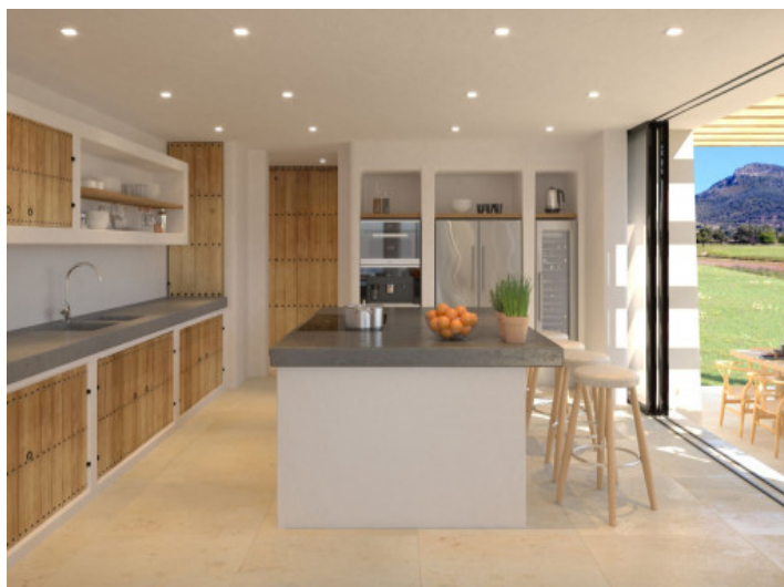
Kitchen with large kitchen island