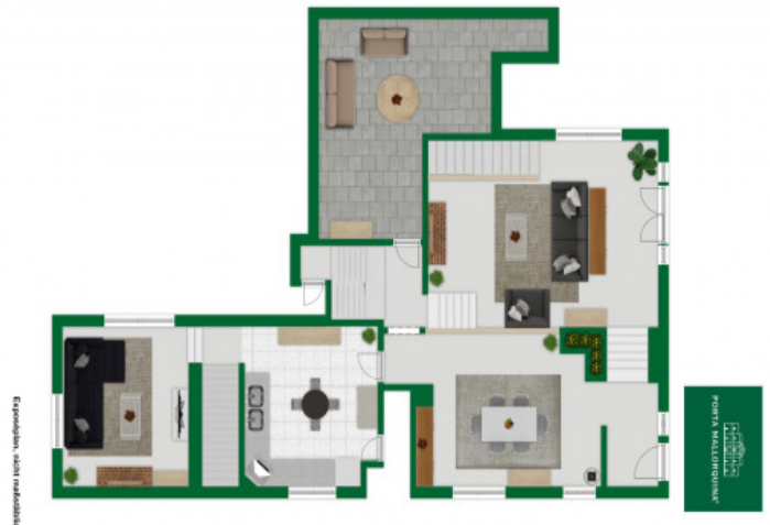
Plan ground floor