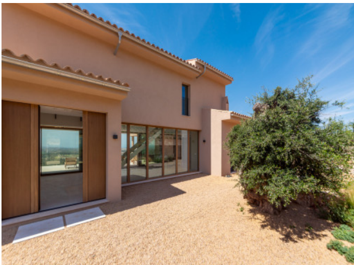
Entrance to the house