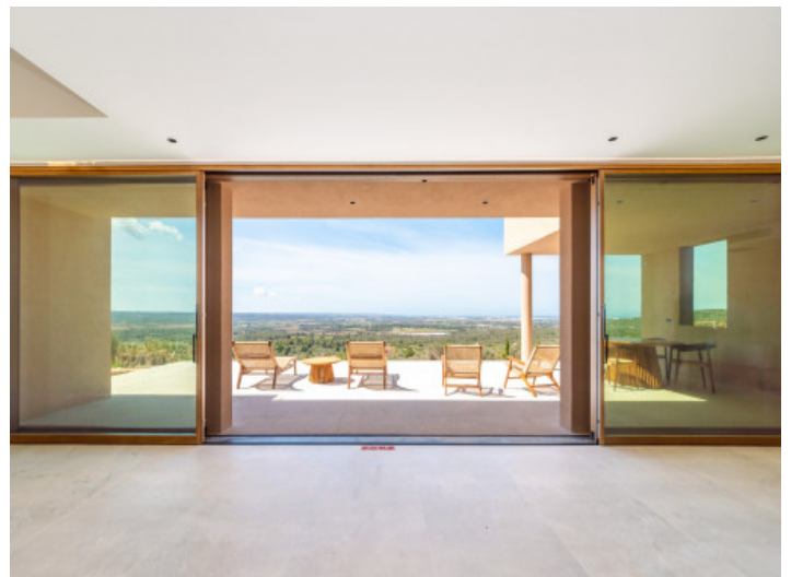
Living area with amazing views

All information is correct to the best of our knowledge. Errors and prior sale excepted. This prospectus is purely for information purposes. Only the notarized deed of sale is legally binding.