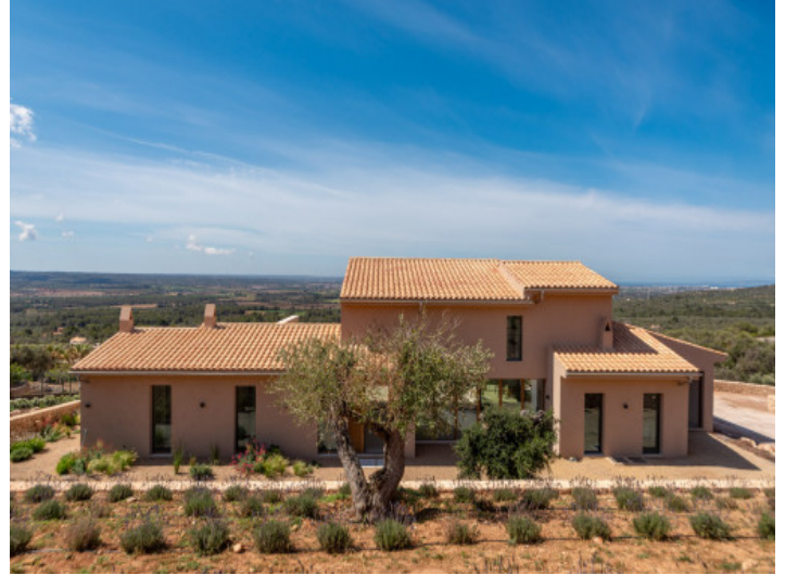
Newly built property with stunning views