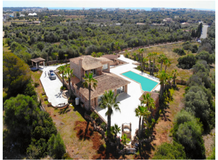
Holiday rental licence