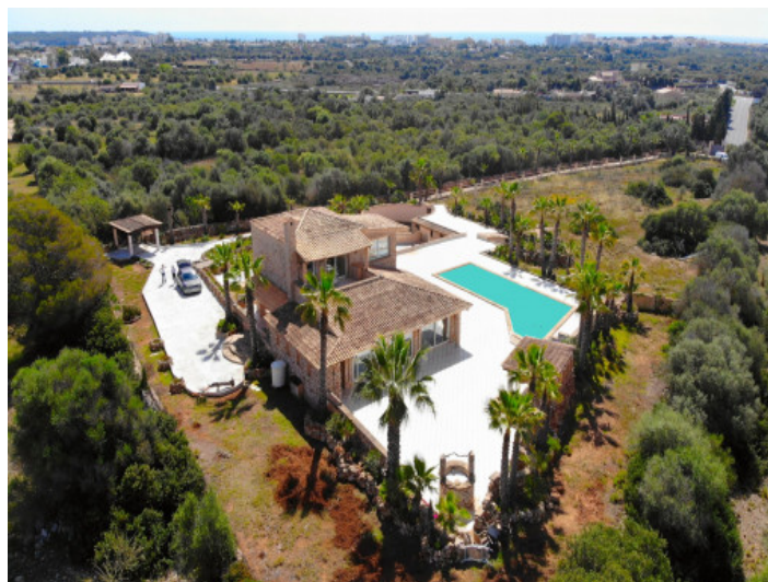
Holiday rental licence