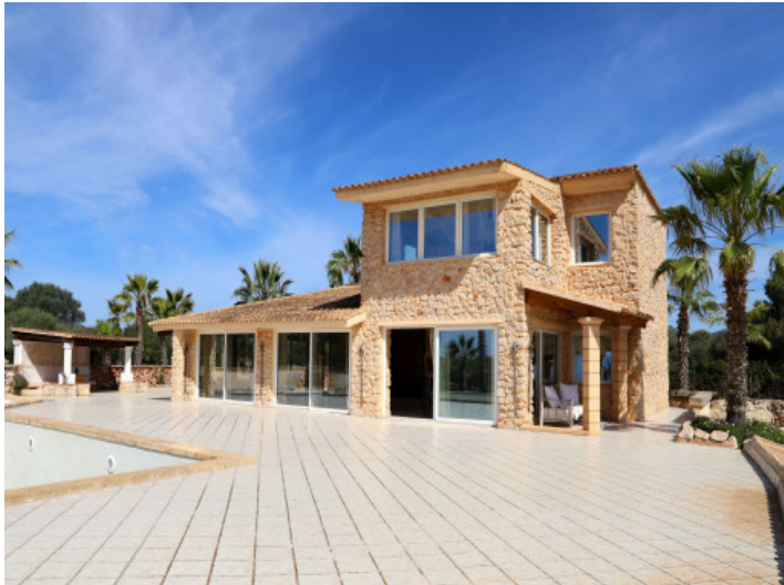
View to the house