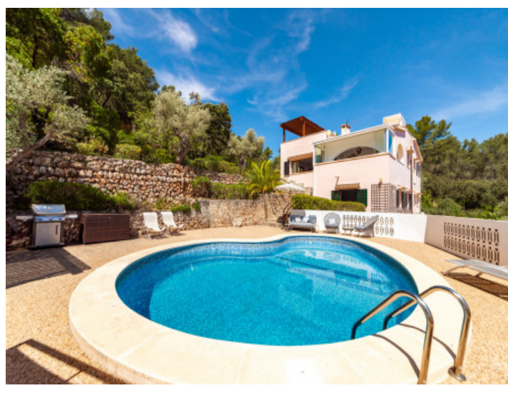
Bathroom Pool area All information is correct to the best of our knowledge. Errors and prior sale excepted. This prospectus is purely for information purposes. Only the notarized deed of sale is legally binding.

PORTA MALLORQUINA • C./ CONQUISTADOR 8, 07001 PALMA TEL. +34 971 698 242 • INFO@PORTAMALLORQUINA.COM