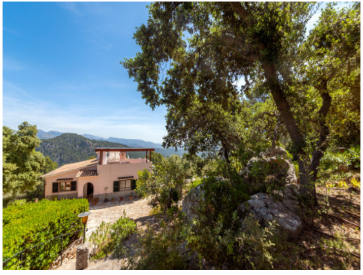
Surrounded by nature