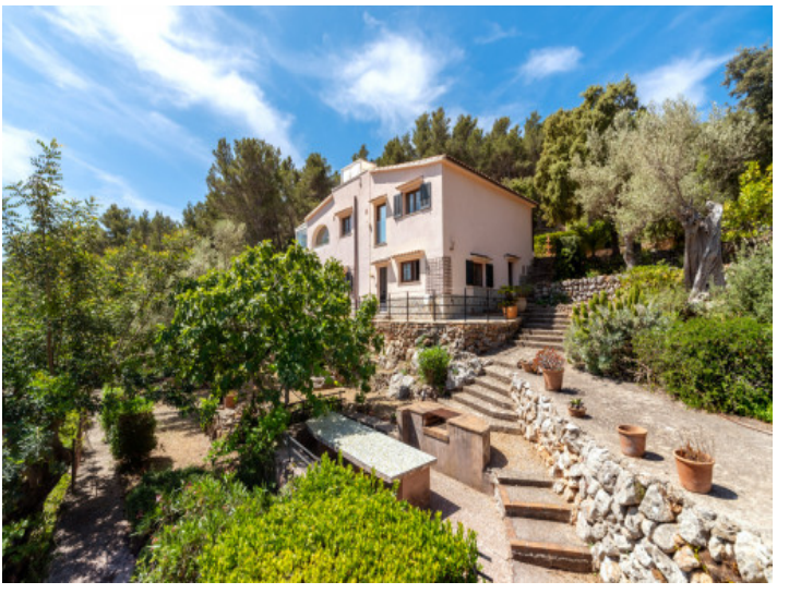
Garden and facade