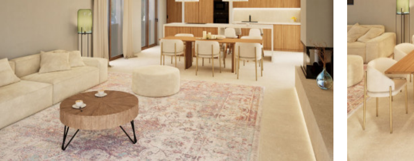
Cozy living area Dining area and kitchen All information is correct to the best of our knowledge. Errors and prior sale excepted. This prospectus is purely for information purposes. Only the notarized deed of sale is legally binding.