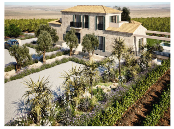
View to the property

All information is correct to the best of our knowledge. Errors and prior sale excepted. This prospectus is purely for information purposes. Only the notarized deed of sale is legally binding.