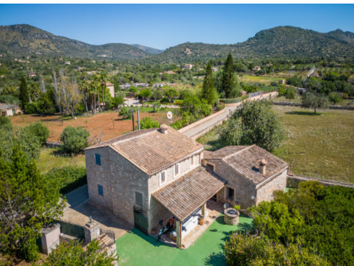
Arial view Living area All information is correct to the best of our knowledge. Errors and prior sale excepted. This prospectus is purely for information purposes. Only the notarized deed of sale is legally binding.