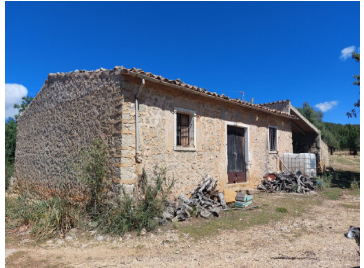
Plot with project