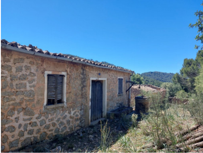
Plot with project