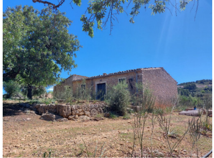
Plot with project