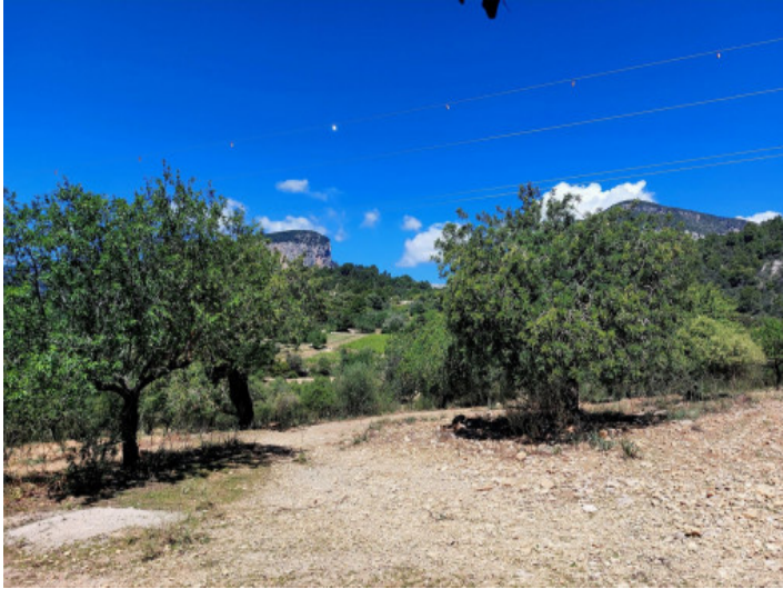
Plot with project