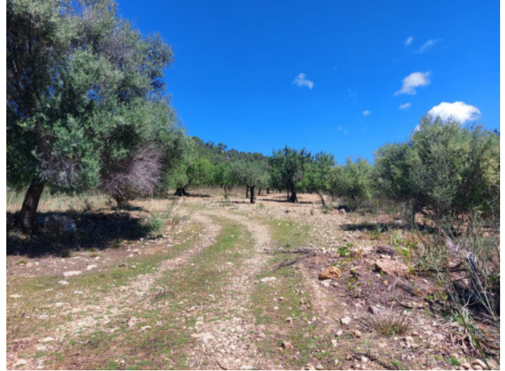
Entrance way to the finca