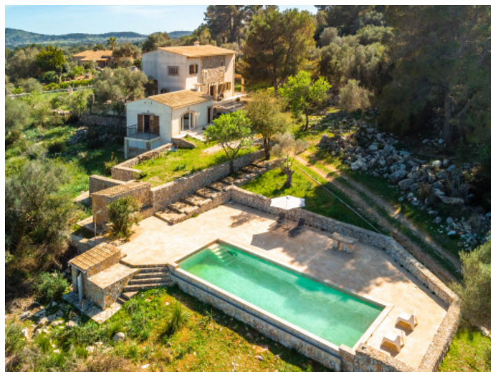
Finca and pool