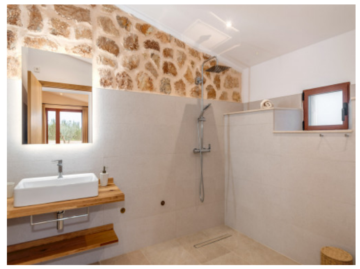
Bathroom en suite with shower

PORTA MALLORQUINA® Your home. Our passion.