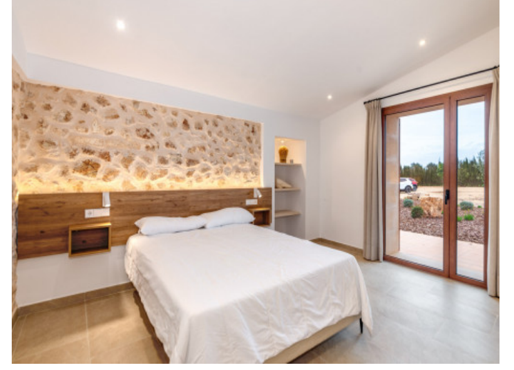
Bedroom on the ground floor with bathroom en suite