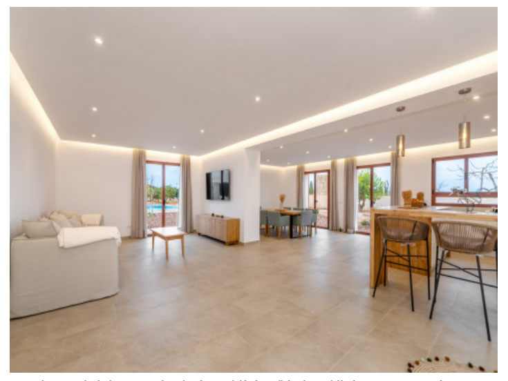
Large, bright, openly-designed living/kitchen/dining area creating a