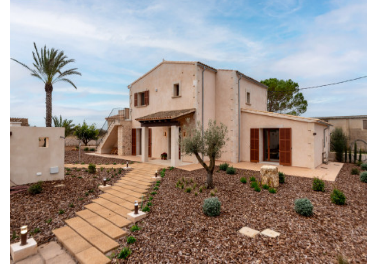
Great family house to rent