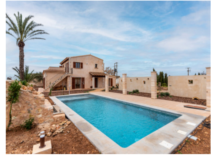
Large pool area