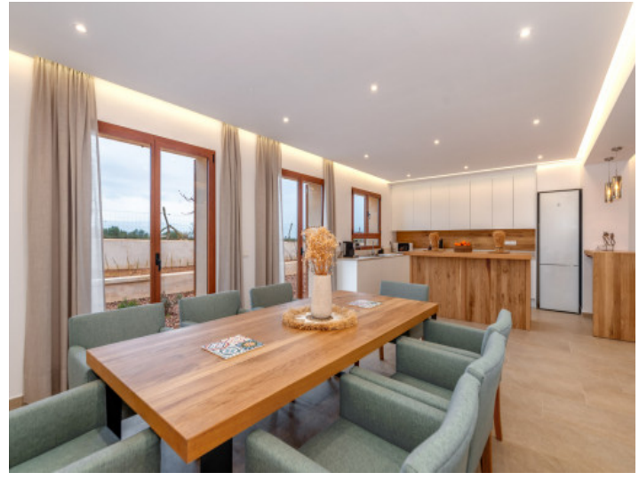
Beautiful dining area