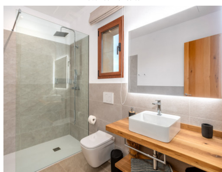
All bathrooms are en suite