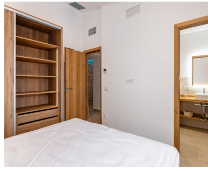
One of 3 bedrooms on the first floor