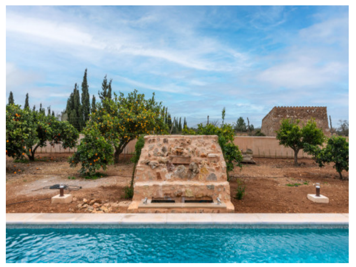
Lots of fruit trees