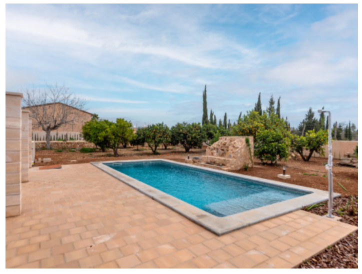
Comfortable countryside pool