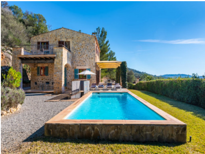
Pool and finca