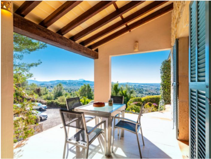
Gorgeous landscape views from the terrace