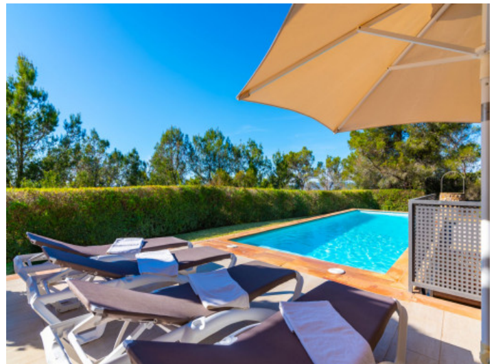
Well-tended pool area