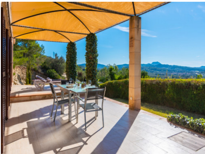
Unique landscape views from the terrace